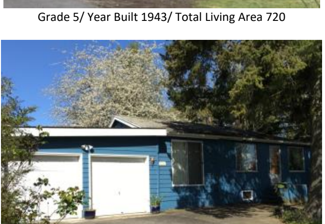
Grade 6/ Year Built 1947/ Total Living Area 1090