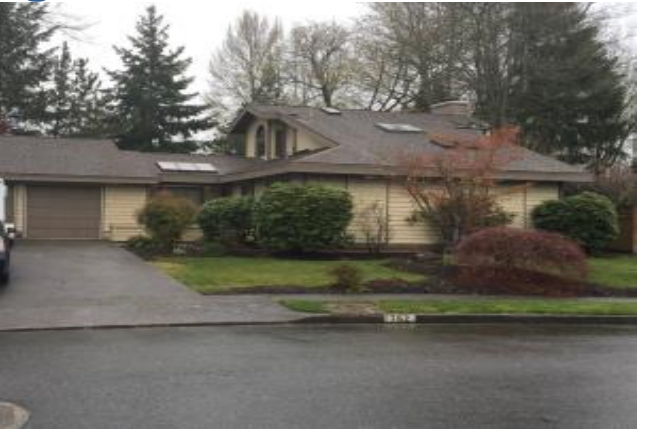
Grade 8/ Year Built 1969/ Total Living Area 2100