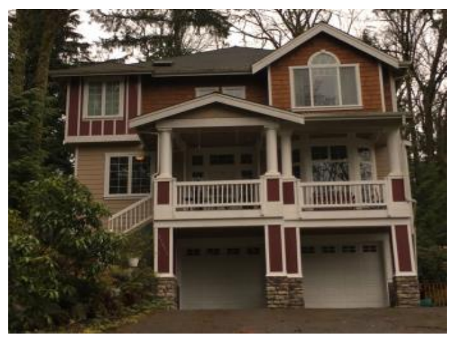
Grade 9 / Year Built 2006 / Total Living Area 3020