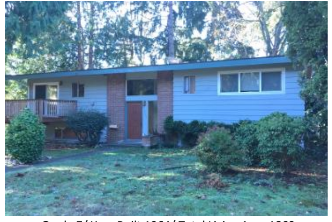
Grade 7/ Year Built 1964/ Total Living Area 1860