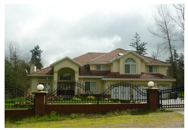
Grade 10/ Year Built 2001/Total Living Area 3570