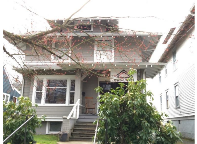
Grade 8/ Year Built 1909/ Total Living 1,730