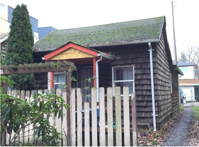
Grade 5/ Year Built 1913/ Total Living 594