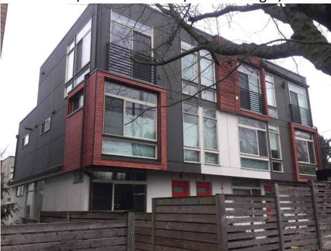
Grade 9/ Year Built 2017/ Total Living 1,750