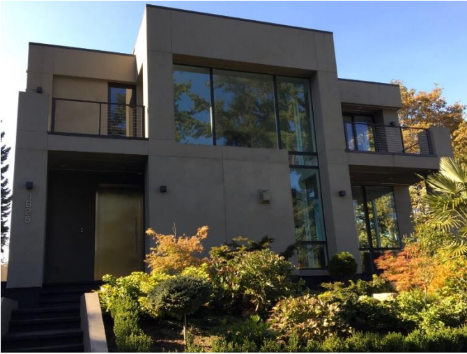
Grade 11/ Year Built 2016/ Total Living 3,440