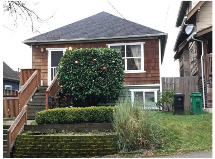
Grade 6/ Year Built 1914/ Total Living 2,350