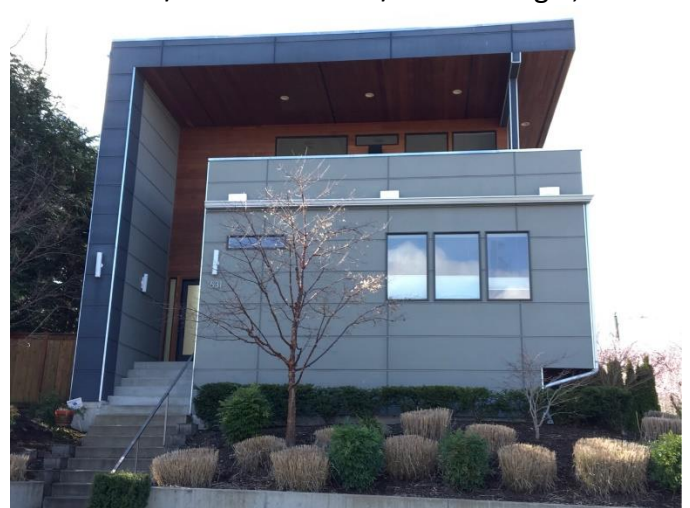
Grade 10/ Year Built 2010/ Total Living 2,060