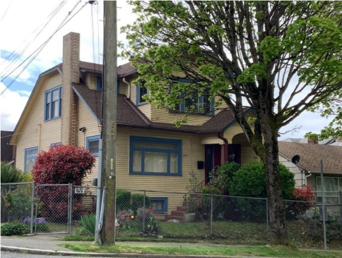
Grade 7/ Year Built 1925/ Total Living 1,510