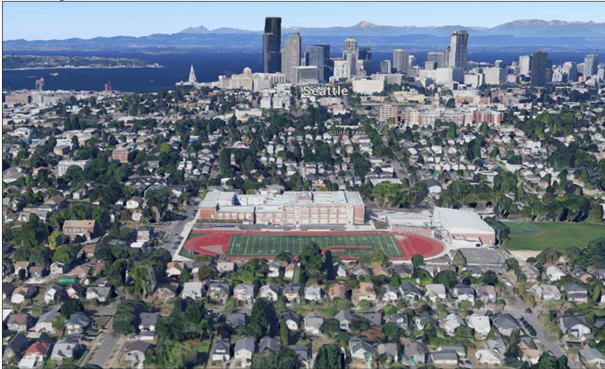
Photo obtained from Google Earth