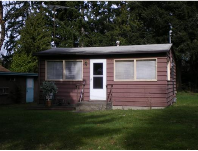
Grade 5/ Year Built 1947 /Total Living Area 530