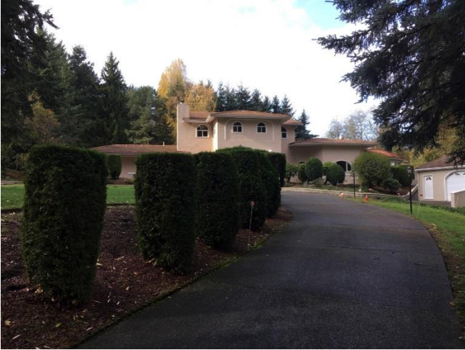
Grade 11/ Year Built 1979 /Total Living Area 6,510