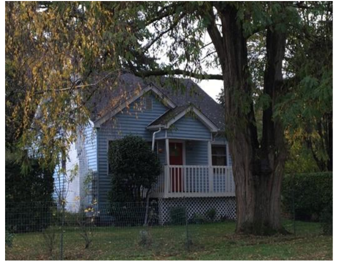
Grade 6/ Year Built 1934/ Total Living Area 1,060