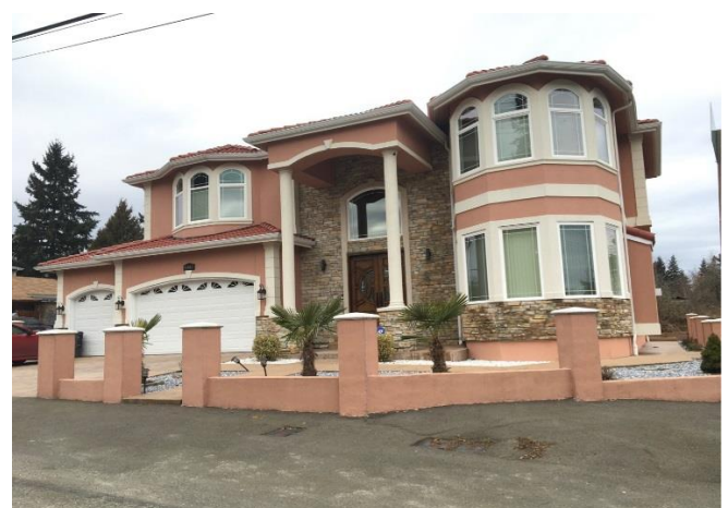
Grade 10/ Year Built 2014 /Total Living Area 4,130