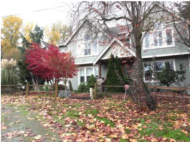
Grade 9/ Year Built 2007 /Total Living Area 5,050