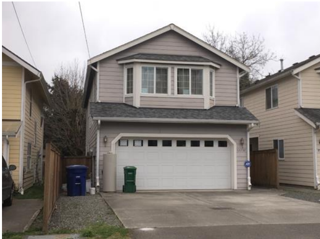
Grade 7/ Year Built 2003/ Total Living Area 1,680