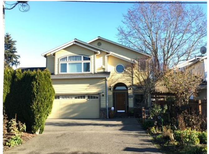
Grade 8/ Year Built 2008/ Total Living Area 3,200