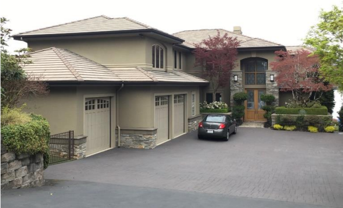
Grade 12/ Year Built 1997 /Total Living Area 8,400