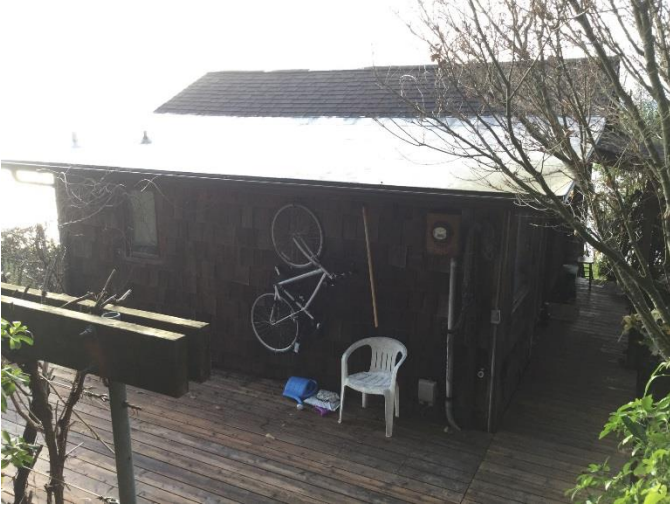
Grade 5/ Year Built 1926/YrRen1995/Total Living Area 530