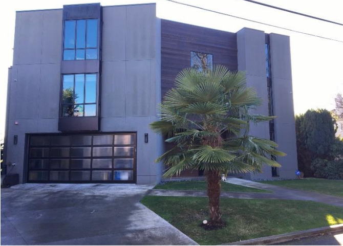
Grade 12/ Year Built 2008/ Total Living Area 6150