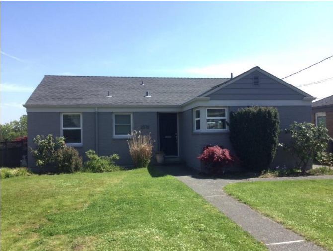
Grade 7/ Year Built 1947/ Total Living Area 1090