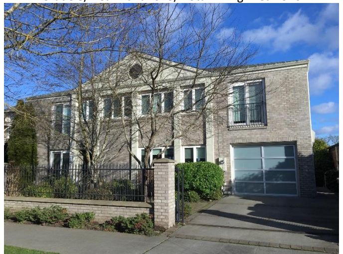
Grade 10/Year Built 1940/Yr Ren 1999/Total Living Area 4880