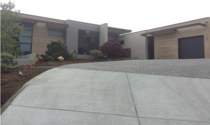
Grade 11/ Year Built 2015/Total Living Area 4760