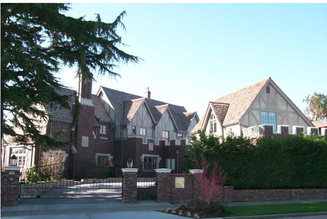
Grade 13/ Yr Built 1933/Yr Ren 2002 /Total Living Area 7100