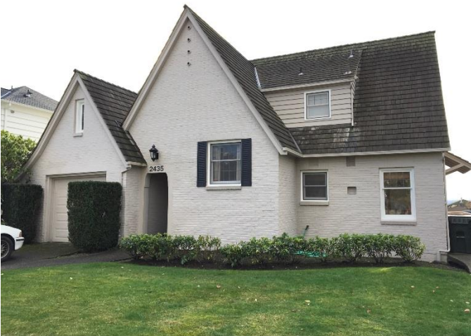
Grade 9/ Year Built 1930/ Total Living Area 2670