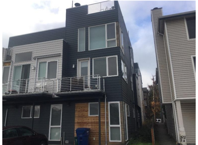
Grade 8/ Year Built 2013/ Total Living Area 1310