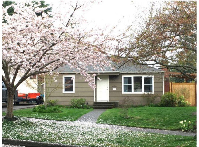
Grade 6/ Year Built 1948/ Total Living Area 870