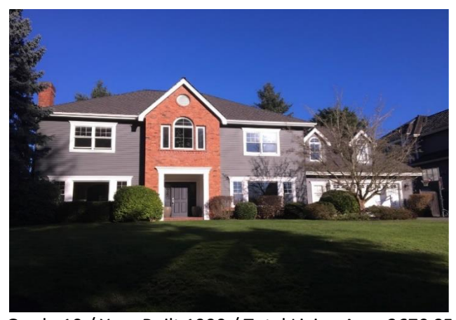
Grade 10 / Year Built 1990 / Total Living Area 3670 SF