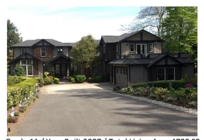
Grade 11 / Year Built 2007 / Total Living Area 4700 SF