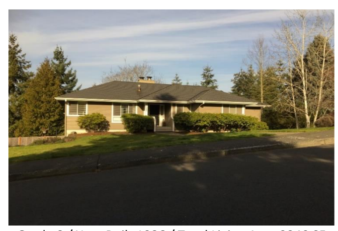
Grade 8 / Year Built 1986 / Total Living Area 2340 SF