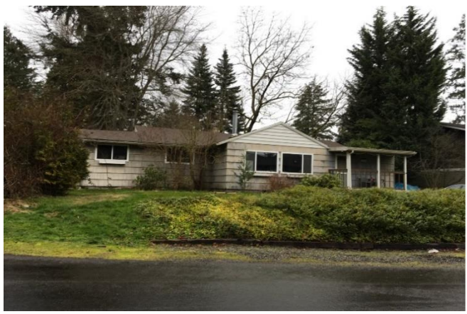
Grade 6 / Year Built 1950 / Total Living Area 1340 SF