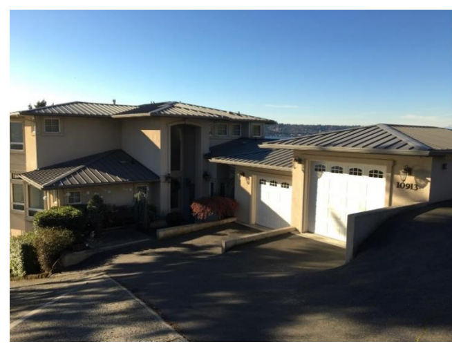
Grade 12 / Year Built 2000 / Total Living Area 5310 SF