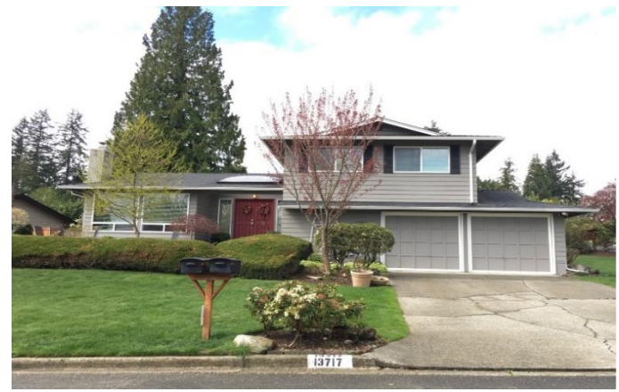
Grade 7 / Year Built 1970 / Total Living Area 1730 SF