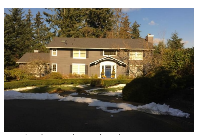
Grade 9 / Year Built 1990 / Total Living Area 3030 SF