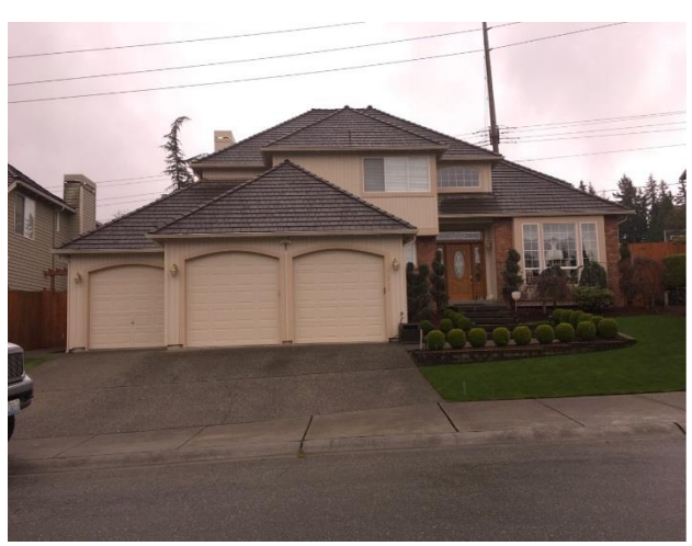
Grade 9 / Year Built 1993 / Total Living Area 2620 SF