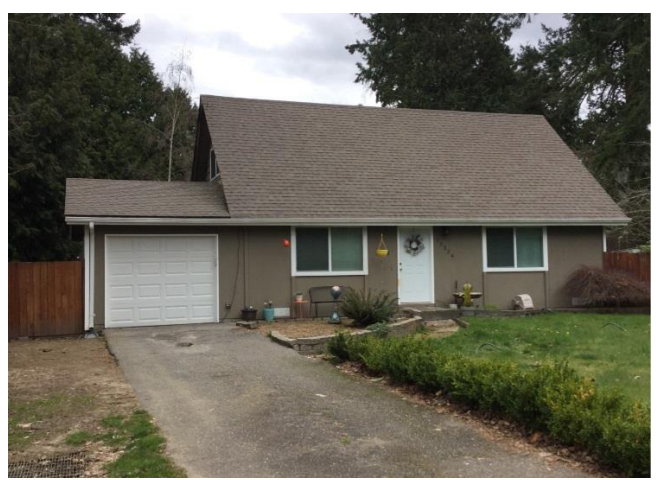
Grade 6 / Year Built 1970 / Total Living Area 750 SF