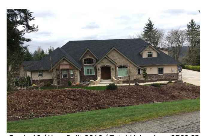
Grade 10 / Year Built 2016 / Total Living Area 3760 SF