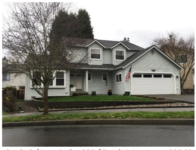
Grade 8 / Year Built 1990 / Total Living Area 1800 SF