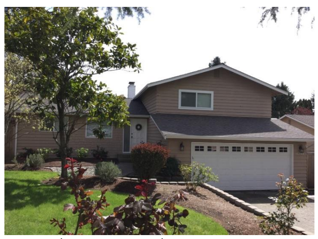
Grade 7 / Year Built 1972 / Total Living Area 1970 SF