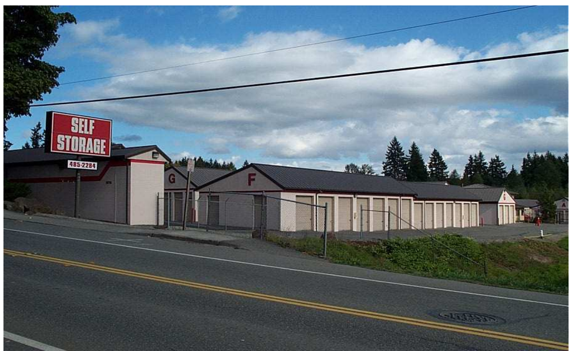
TYPICAL OLDER FACILITY – 18716 68<sup>TH</sup> AVE NE, KENMORE