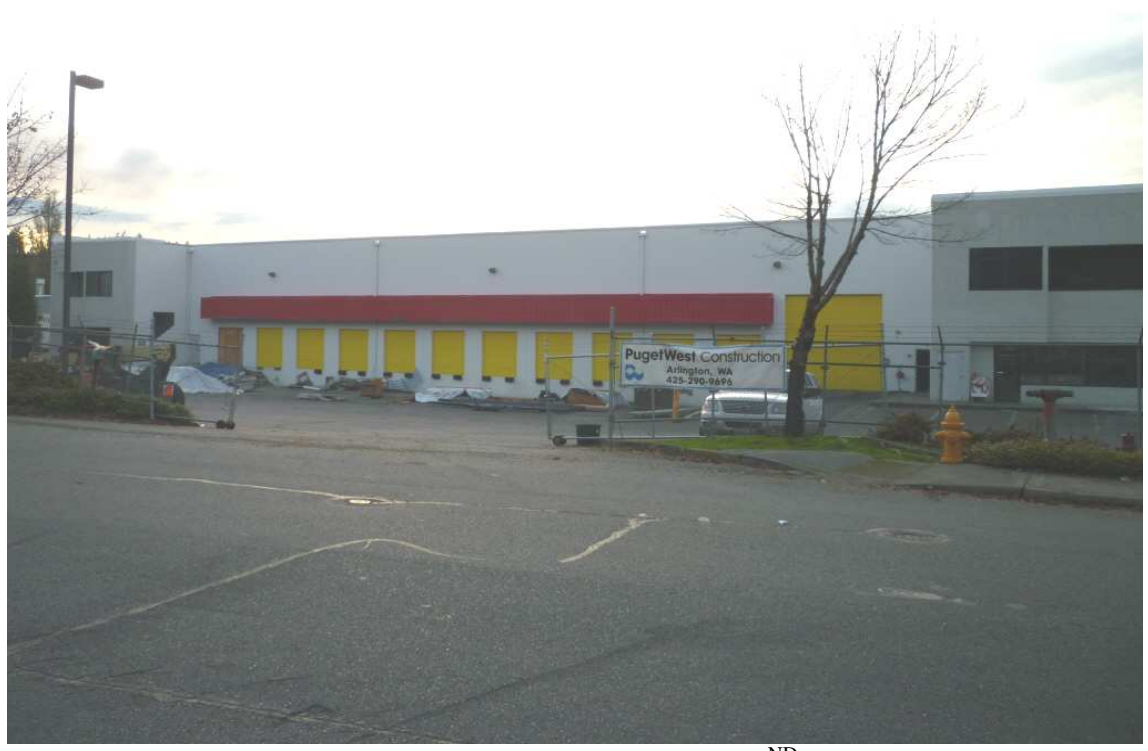
SUBURBAN WAREHOUSE CONVERSION – 7115 132<sup>ND</sup> PL. SE, NEWCASTLE