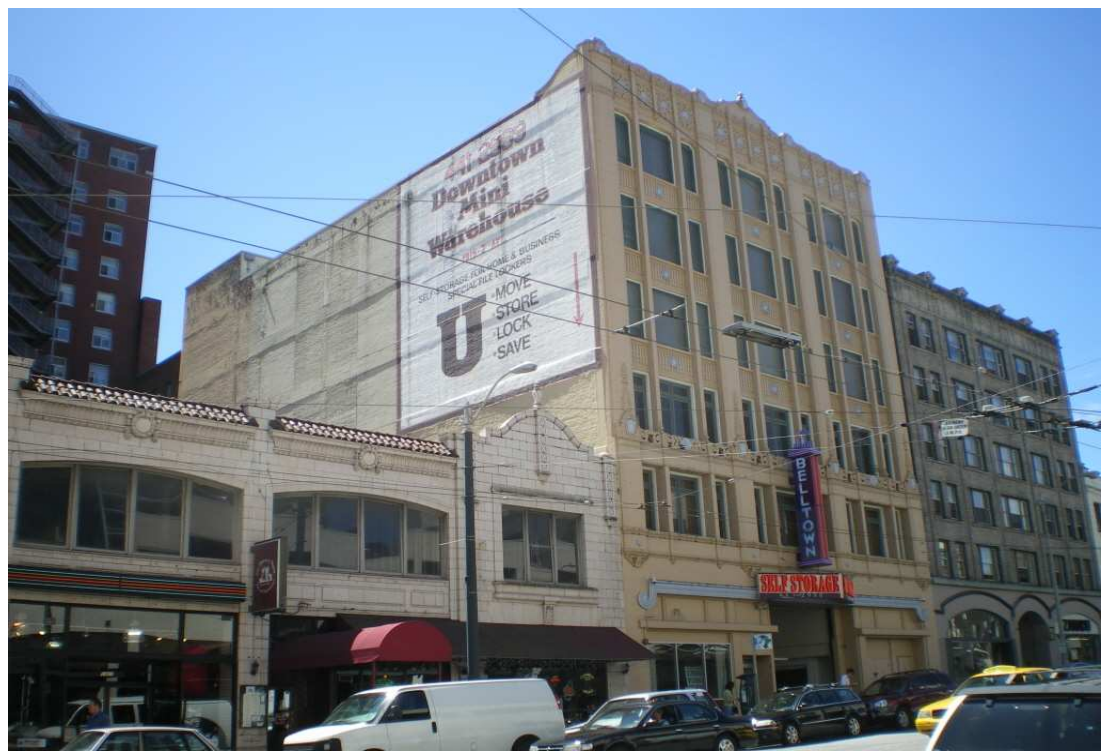
URBAN WAREHOUSE CONVERSION – 1915 3RD AVE, SEATTLE