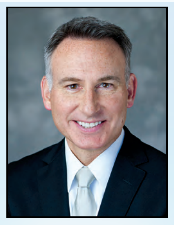
King County Executive Dow Constantine