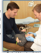
Dad, child and pediatric dentist

Making sure that your children have healthy teeth and mouths for a lifetime begins early. Babies should be checked by a dentist or doctor by the time their first tooth appears or by their first birthday.