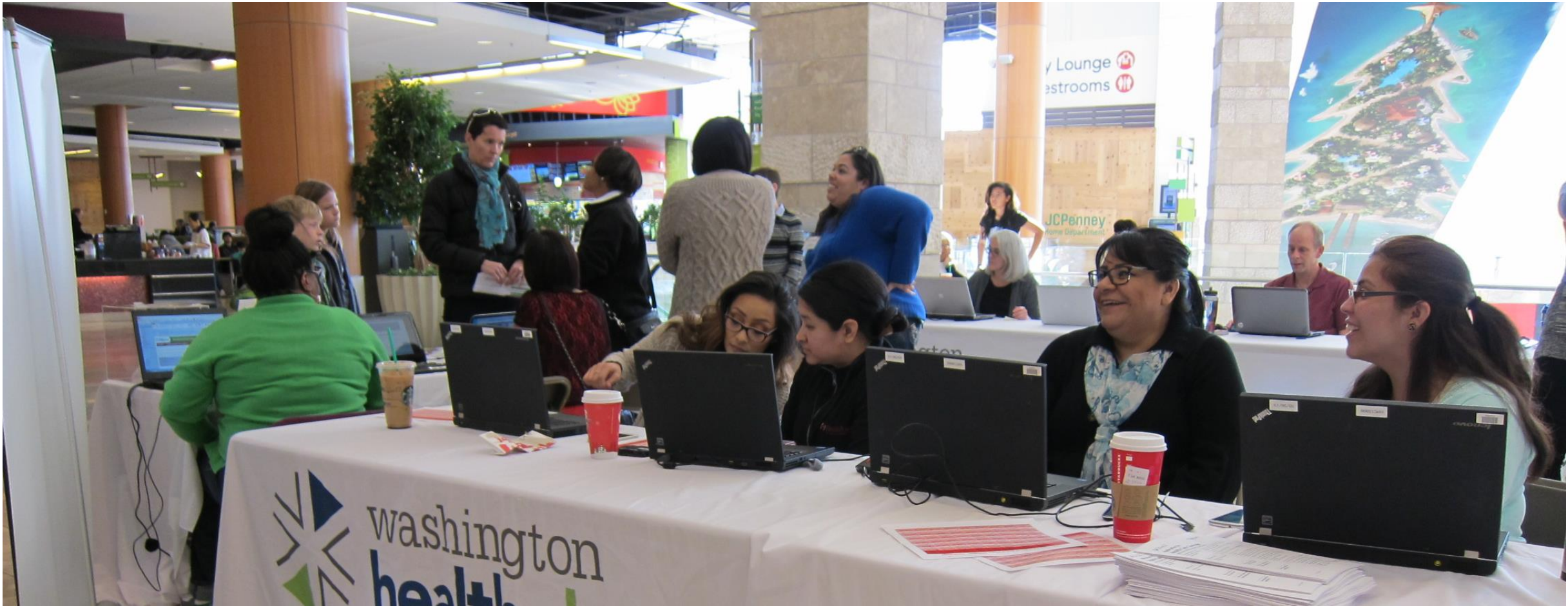
Southcenter Mall Enrollment event | OEIV