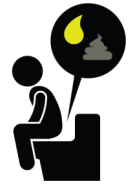
Kaadi madaw, saxaro cad, shuban

Dadka qaar ee qaba cagaarshowga A ma lahan wax astaamo ah Haddii aad u maleynaysid in aad qabtid cagaarshowga A, la kulan dhakhtarkaada ama aad isbitaalka