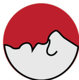
Slow or no breathing