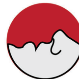
Slow or no breathing