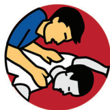
Won't wake up

Look for these signs of overdose early to save your friend's life.