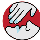
Blue lips or nails