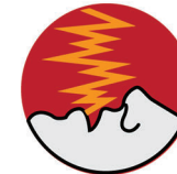
Gurgling or snoring