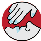
Blue lips or nails