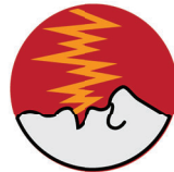
Gurgling or snoring