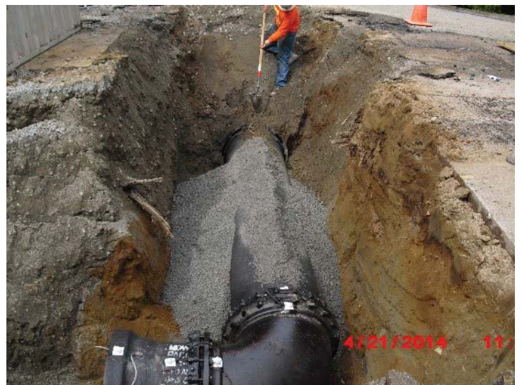
An example of sewer pipe installation in an open trench

For maintenance work along Mercer Slough, equipment will be stored adjacent to the trails from summer 2023 through early 2024. In general, the bike trail will remain open. Intermittent (less than 15 minutes) closures will occur to allow equipment access along the bike trail. Other closures to repair equipment damage to trail sections may require short walkarounds adjacent to the trail. Where space is not available for a walkaround, detour routes will be used.