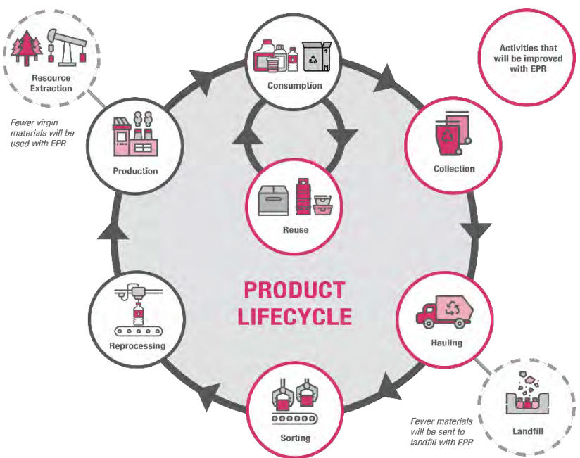
Figure 1. EPR would make companies responsible for the reuse and recycling of their packaging and paper products ensuring that they become new products and materials in a circular economy.

Recycling has become increasingly more challenging for local governments to manage due to a dramatic rise in the quantity and different types of packaging in the waste stream. In 2018, China and other countries restricted the import of recyclable materials from the U.S. These recent changes have made the system more expensive to run, leading to service cuts and/or increased costs for residents.