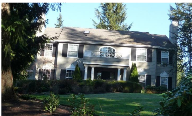
Grade 10/ Year Built 2000/ Total Living Area 3920