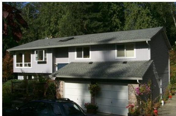
Grade 7/Year Built 1983/Total Living Area 2400