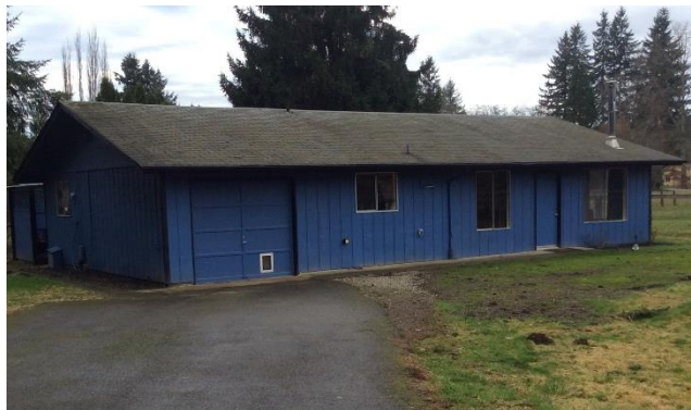
Grade 6/Year Built 1979/Total Living Area 1010