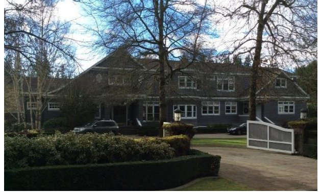
Grade 13/Year Built 1991/Total Living Area 14030