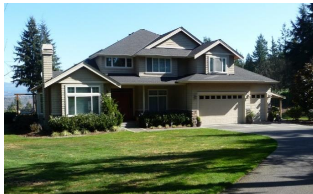
Grade 9/Year Built 2002/Total Living Area 3900