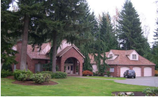
Grade 12/Year Built 1989/Total Living Area 5510