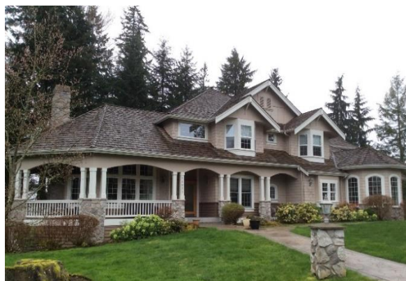
Grade 11/Year Built 2002/Total Living Area 4540