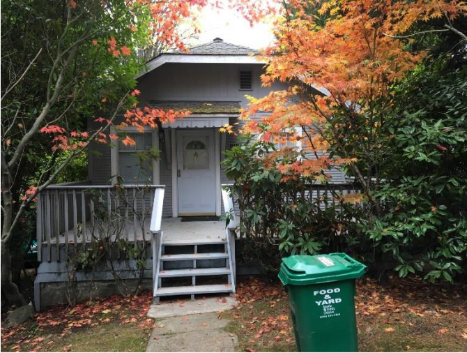
Grade 5/ Year Built 1980/ Total Living Area 600sf