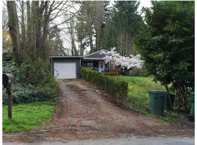
Grade 6/ Year Built 1951/ 990sf