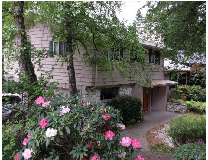
Grade 8/ Year Built 1963/ Total Living Area 2,310sf