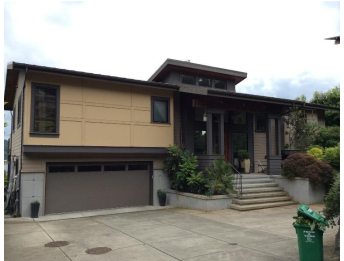
Grade 10/ Year Built 2006/ Total Living Area 3,510sf