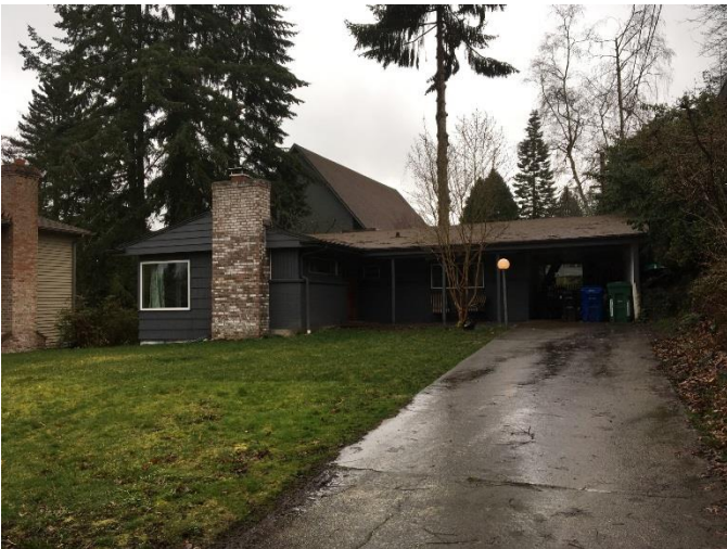
Grade 7/ Year Built 1948/ Total Living Area 1,440sf