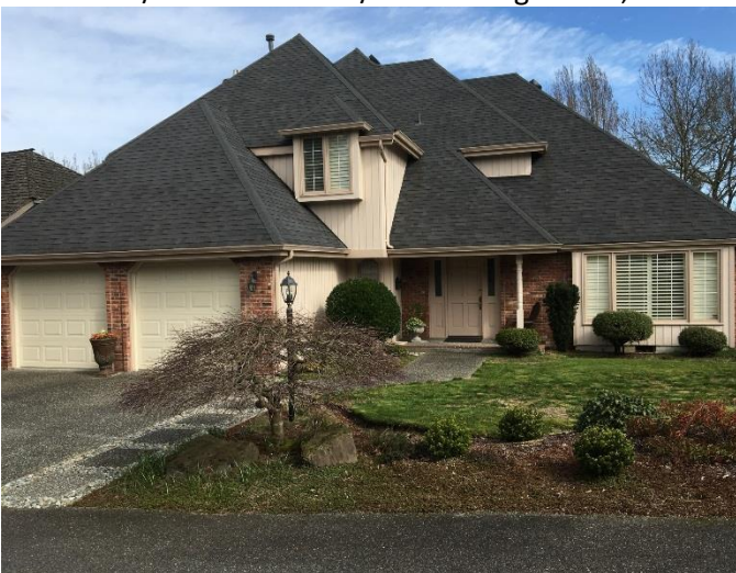
Grade 9/ Year Built 1986/ Total Living Area 2,960sf