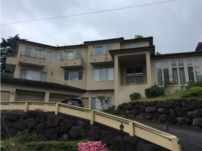
Grade 11/ Year Built 1990/ Total Living Area 4,620sf