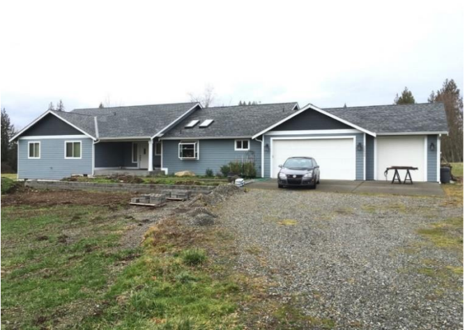
Grade 7/ Year Built 2014 / Total Living Area 2,190