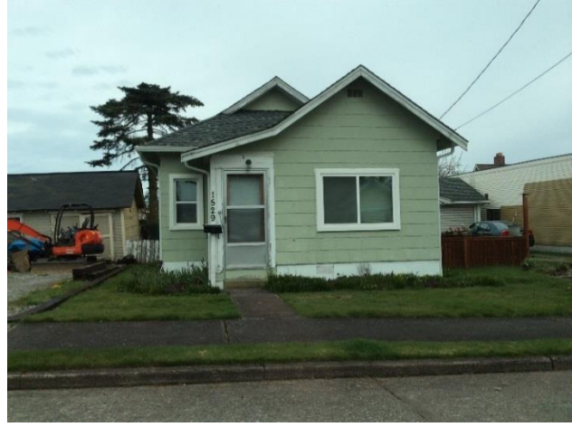
Grade 5/ Year Built 1910/ Total Living Area 780