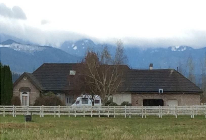
Grade 10/ Year Built 1991/ Total Living Area 3690