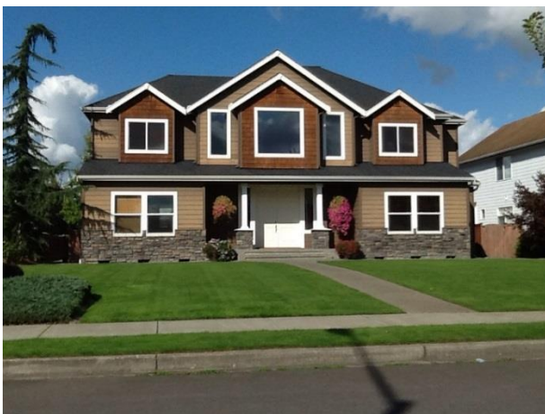
Grade 8/ Year Built 2004/ Total Living Area 2850