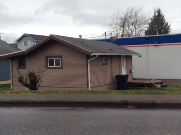
Grade 4/ Year Built 1919/ Total Living Area 480