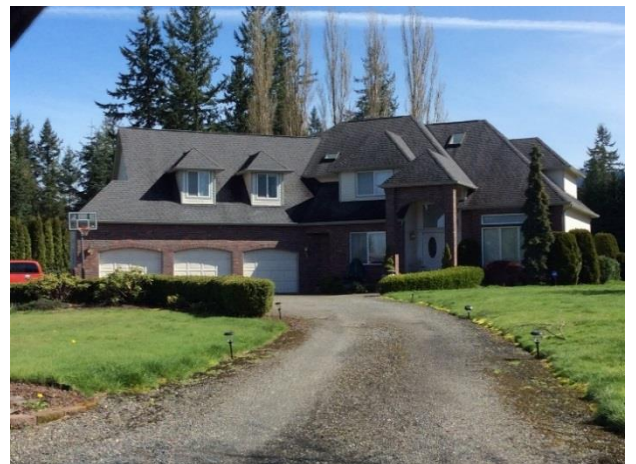
Grade 9/ Year Built 1996/ Total Living Area 3640