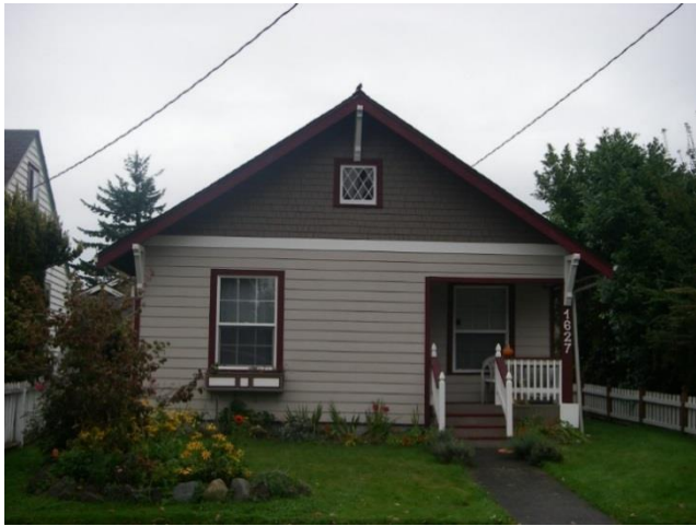
Grade 6/ Year Built 1910/ Total Living Area 960