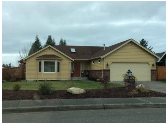
Grade 7/ Year Built 1997/ Total Living Area 1850