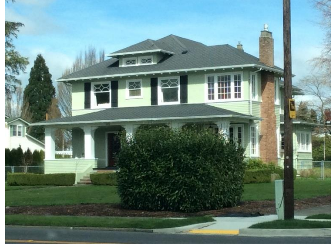
Grade 11/ Year Built 1903/ Total Living Area 6310