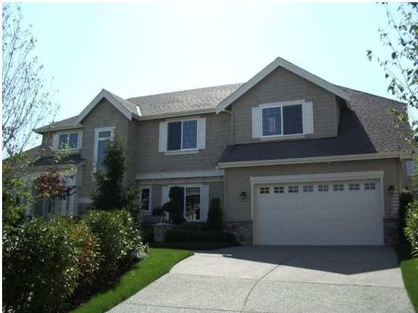
Grade 10/ Year Built 2006/ Total Living Area 3,210sf