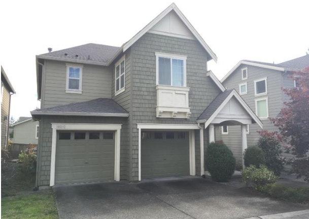
Grade 8/ Year Built 2008/ Total Living Area 2,520sf