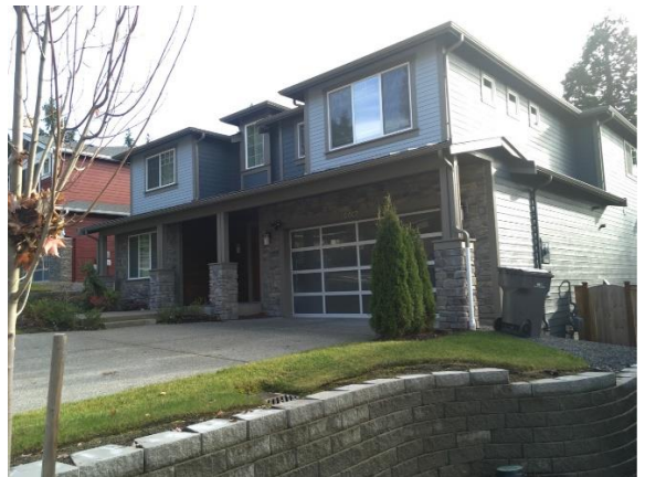
Grade 9/ Year Built 2018/ Total Living Area 4,000sf