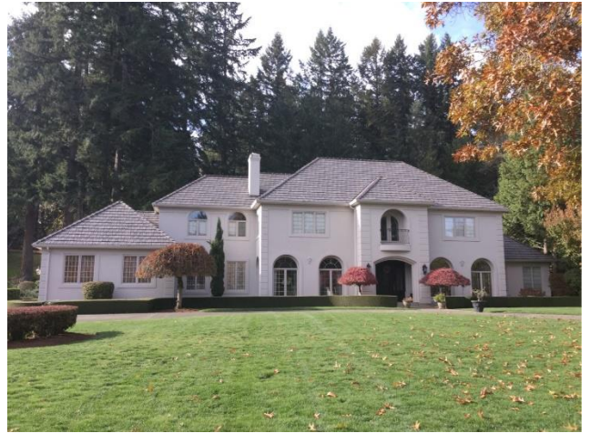
Grade 13/ Year Built 1990/ Total Living Area 5,870sf