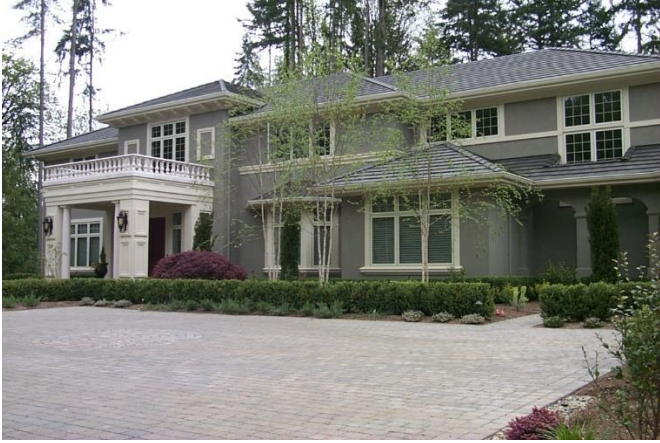
Grade 12/ Year Built 2008/ Total Living Area 8,090sf