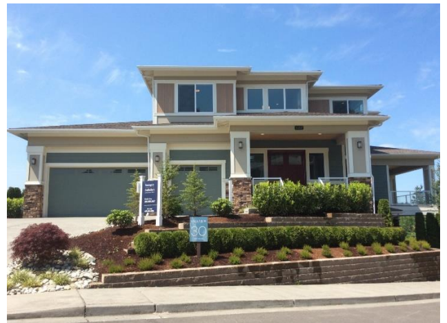
Grade 11/ Year Built 2014/ Total Living Area 4,460sf