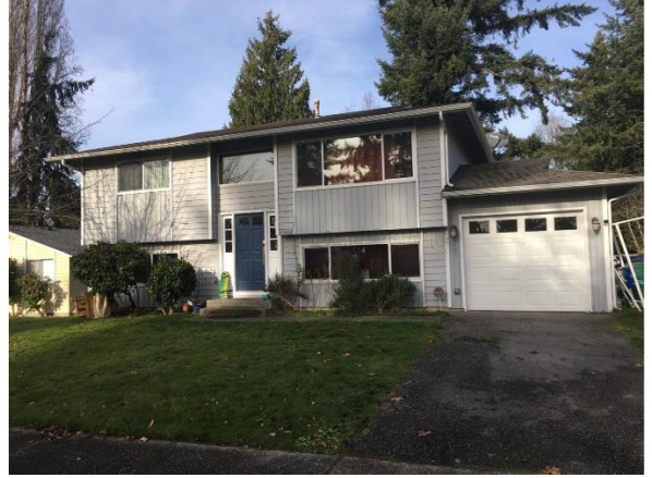
Grade 7/ Year Built 1973/ Total Living Area 1,660sf