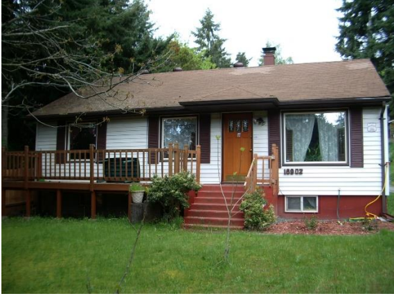
Grade 6/ Year Built 1939/ Total Living Area 2,270sf