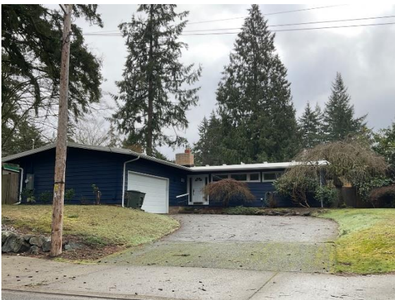
Grade 7/ Year Built 1959/ Total Living Area 1,430