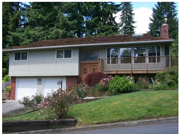
Grade 8/ Year Built 1976/ Total Living Area 2,400