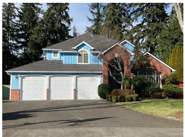
Grade 10/ Year Built 1995/ Total Living Area 3,430