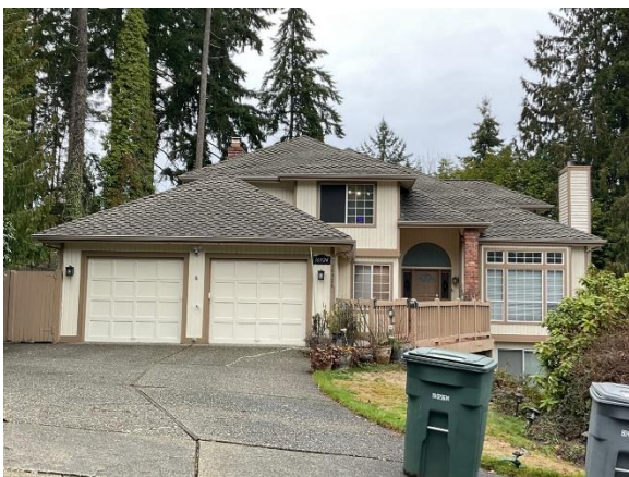
Grade 9/ Year Built 1987/ Total Living Area 3,060