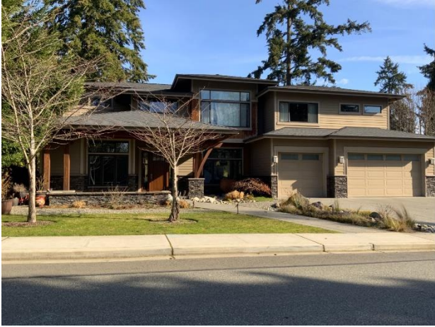
Grade 11/ Year Built 2013/ Total Living Area 4,570