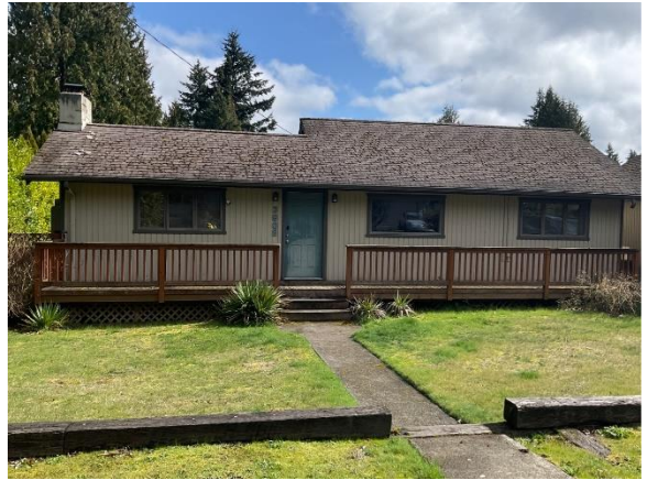
Grade 6/ Year Built 1926/ Total Living Area 1,030