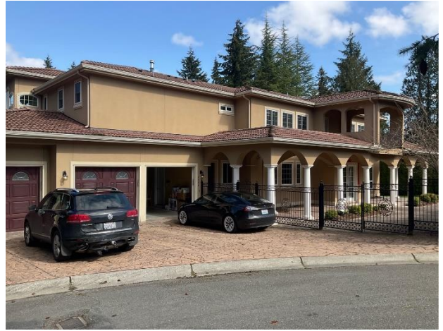
Grade 12/ Year Built 2007/ Total Living Area 6,380