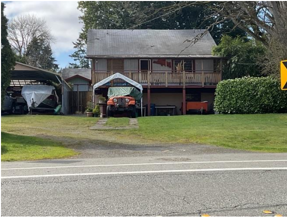
Grade 5/ Year Built 1916/ Total Living Area 1,000