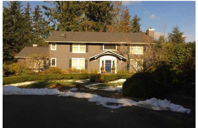
Grade 9 / Year Built 1990 / Total Living Area 3030 SF