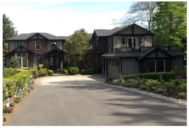
Grade 11 / Year Built 2007 / Total Living Area 4700 SF