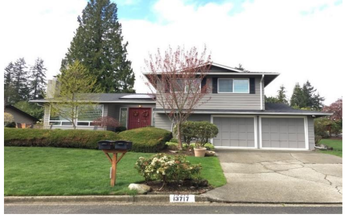
Grade 7 / Year Built 1970 / Total Living Area 1730 SF