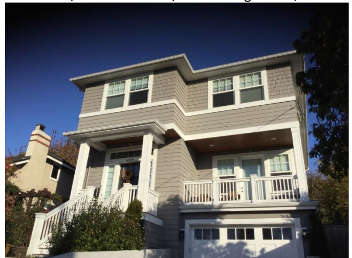
Grade 10/ Year Built 2017/ Total Living Area 3,620