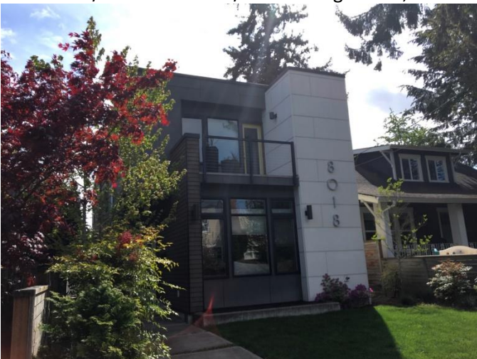
Grade 9/ Year Built 2013/ Total Living Area 2,740sf