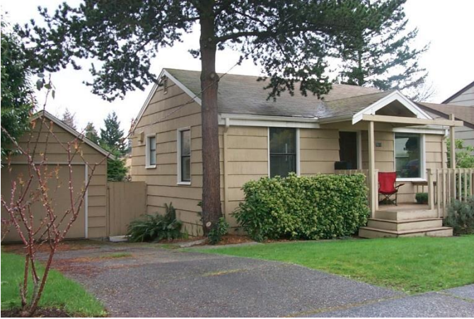
Grade 5/ Year Built 1947/ Total Living Area 520sf