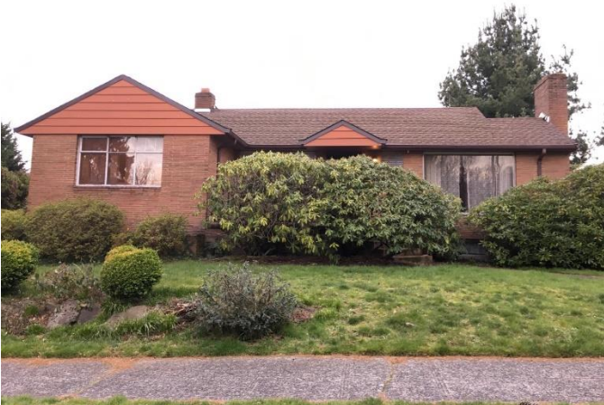
Grade 7/ Year Built 1951/ Total Living Area 1,420sf