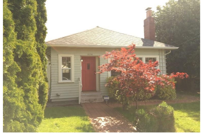
Grade 6/ Year Built 1909/ Total Living Area 850sf