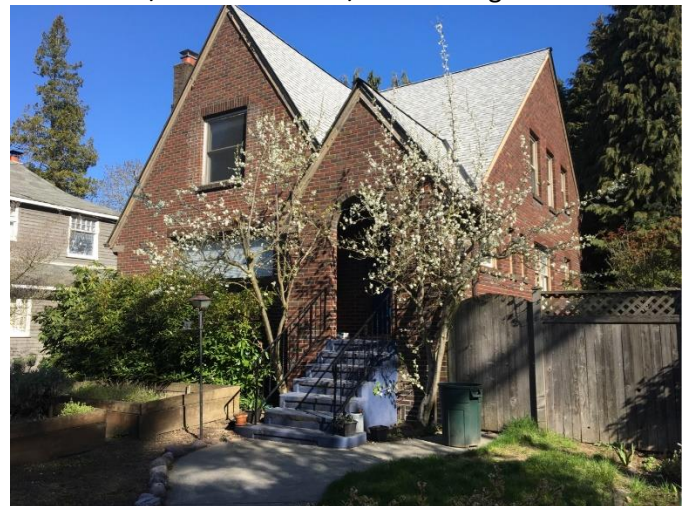
Grade 8/ Year Built 1929/ Total Living Area 2,190sf