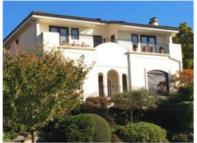
Grade 10/Year Built 1932/Total Living 2790