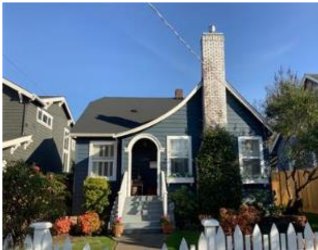
Grade 7/Year Built 1925/Total Living 1180