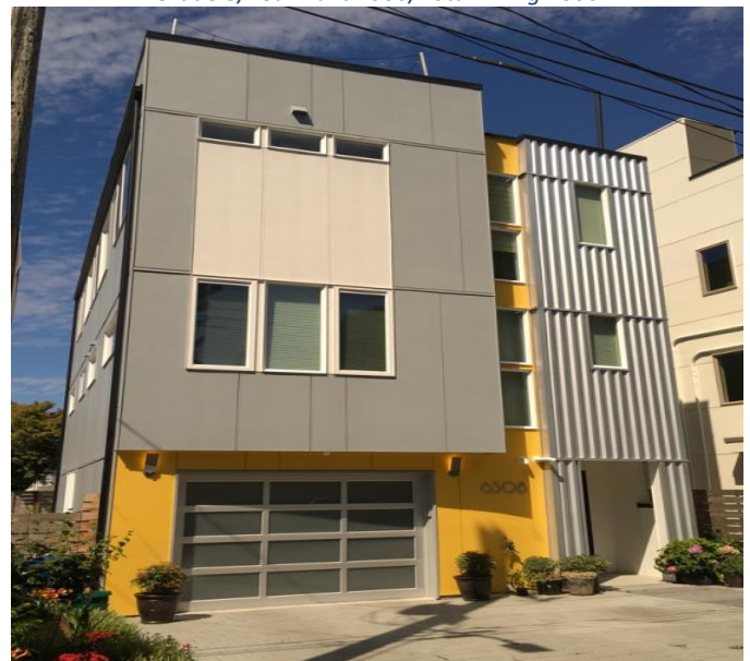
Grade 9/Year Built 2017/Total Living 2590