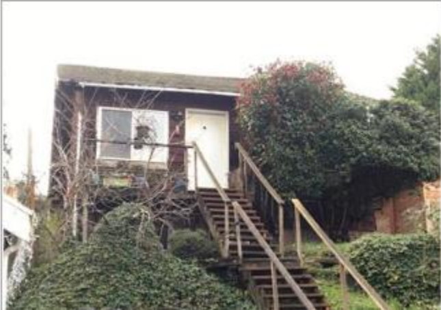
Grade 5/Year Built 1916/Total Living 720