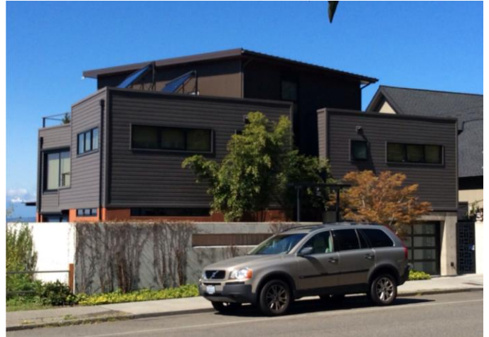
Grade 11/Year Built 2011/Total Living 3390