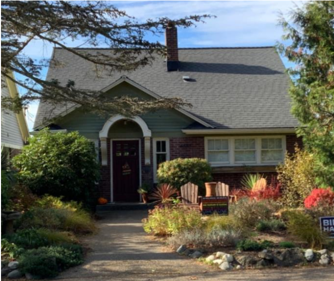
Grade 8/Year Built 1928/Total Living 2010