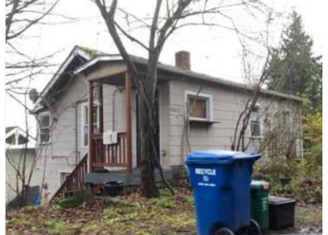
Grade 5/Year Built 1921/Total Living 640