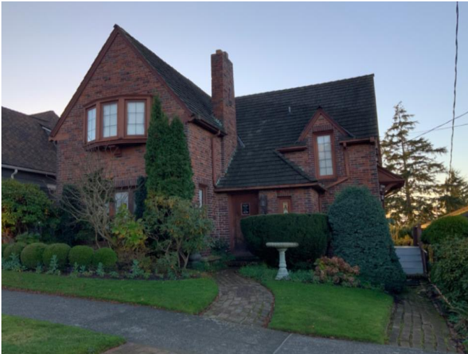
Grade 9/Year Built 1928/Total Living 1460