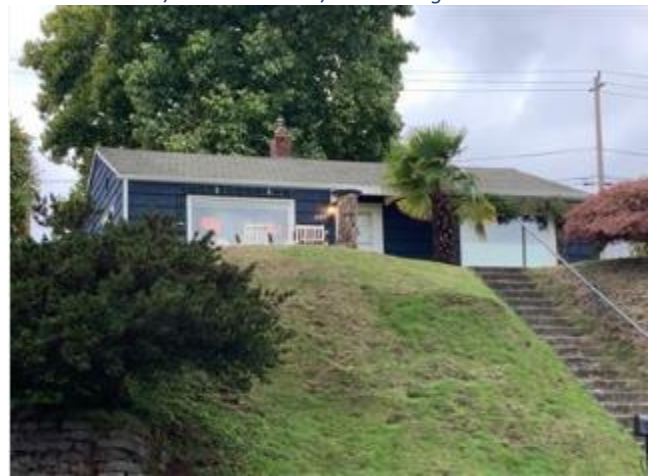
Grade 6/Year Built 1948/Total Living 880