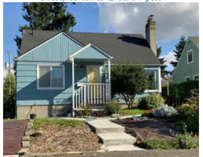
Grade 7/Year Built 1946/Total Living 1200