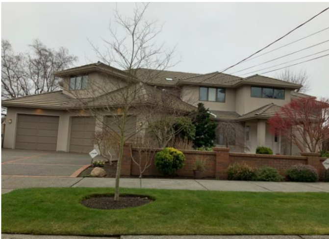
Grade 11/Year Built 1994/Total Living 3310