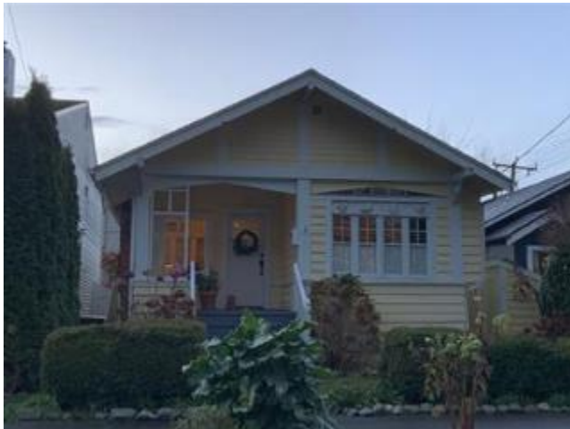
Grade 6/Year Built 1911/Total Living 950