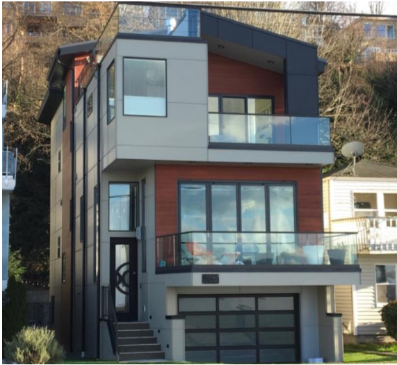
Grade 10/Year Built 2015/Total Living 2720