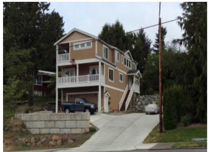
Grade 8/Year Built 2006/Total Living 2600