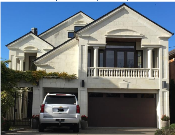
Grade 12/Year Built 2008/Total Living 6790