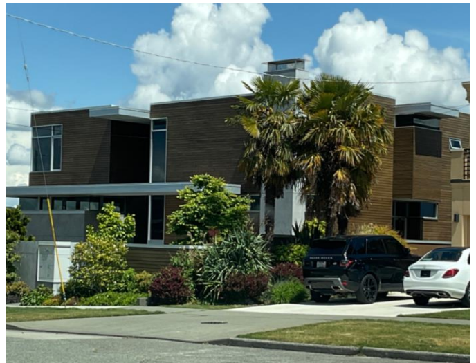
Grade 12/Year Built 2015/Total Living 7870