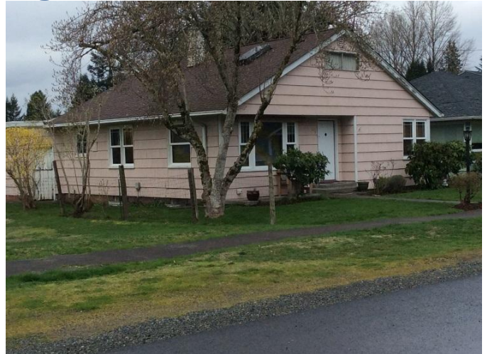
Grade 6/ Year Built 1951/ Total Living Area 1,290