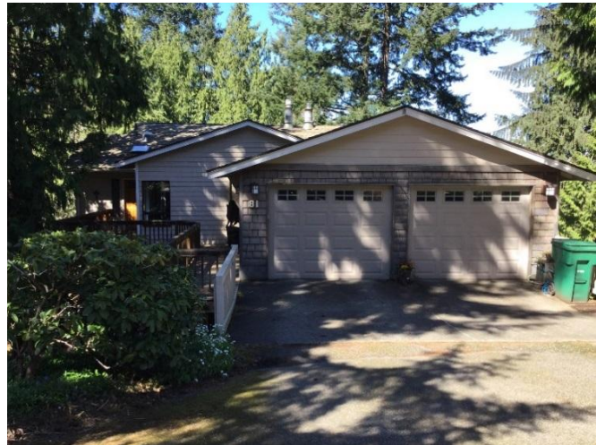
Grade 8/ Year Built 1978/ Total Living Area 2,300