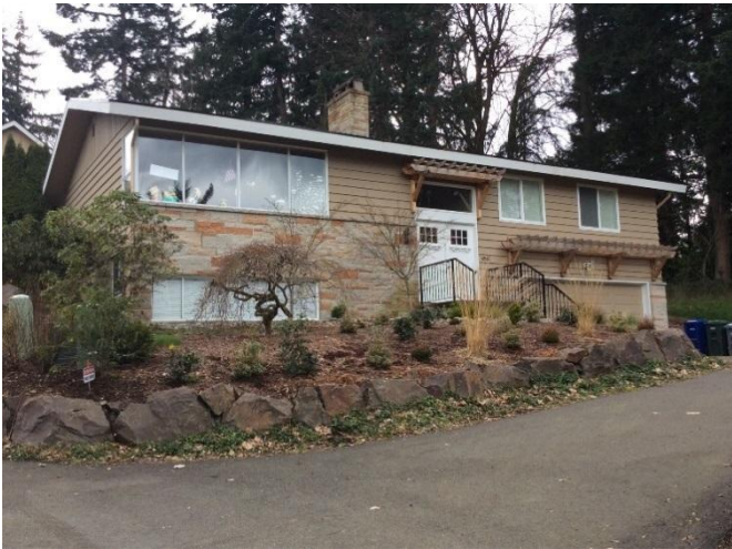
Grade 7/ Year Built 1960/ Total Living Area 2,000