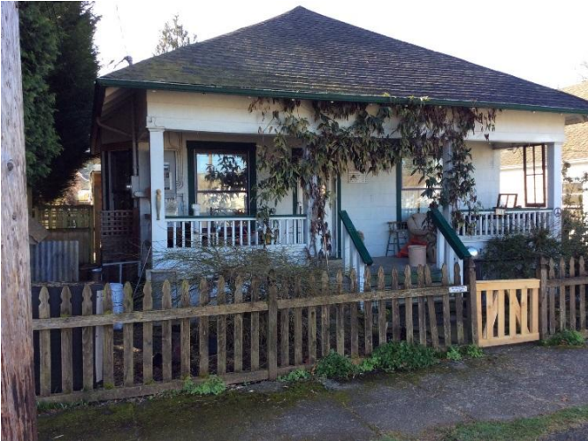
Grade 5/ Year Built 1900/ Total Living Area 1,040