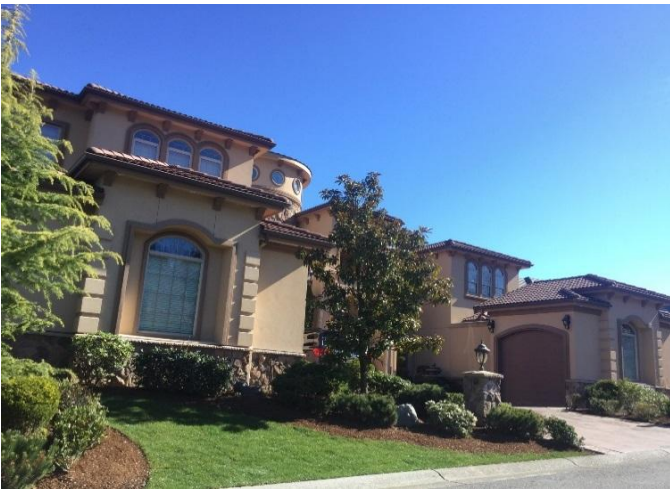
Grade 13/Year Built 2008/ Total Living Area 8,090