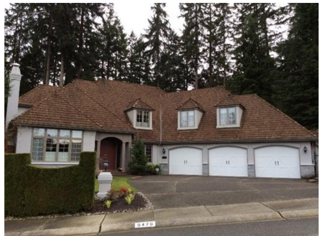
Grade 10/Year Built 1995/ Total Living Area 3,690