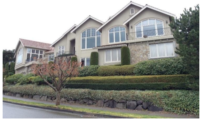
Grade 12/Year Built 2000/ Total Living Area 5,370