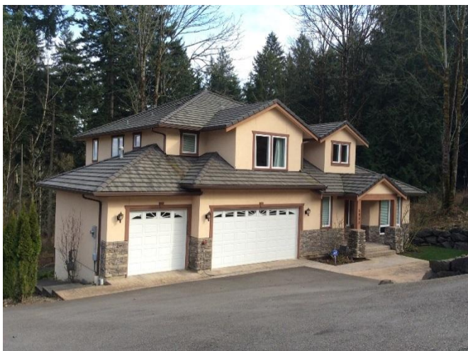
Grade 9/Year Built 2008/ Total Living Area 3,690