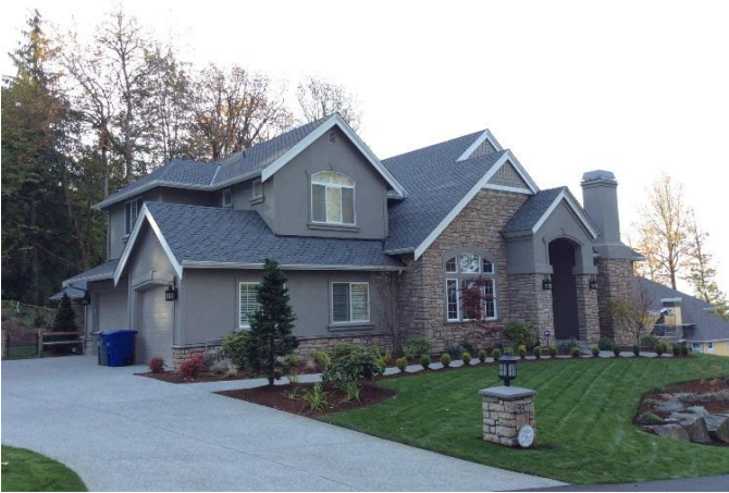
Grade 11/Year Built 2015/ Total Living Area 5,640