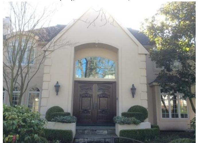
Grade 12/ Year Built 1993/ TLA 6190 SF