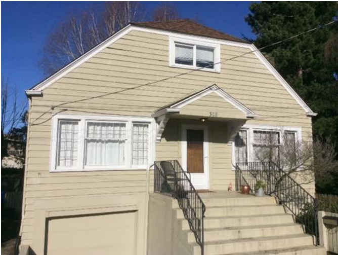
Grade 7/Year Built 1958/TLA 1580 SF