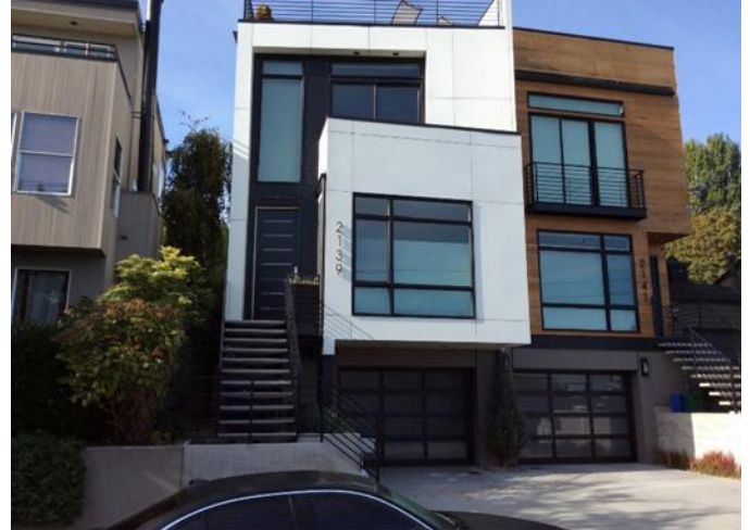
Grade 9 (TH)/ Year Built 2013/ TLA 1960 SF