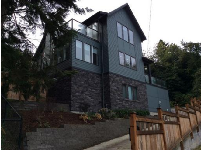
Grade 9/ Year Built 2014/ TLA 3660 SF