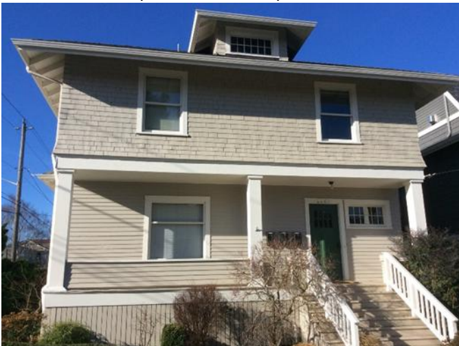
Grade 8/Year Built 1911/TLA 3890 SF