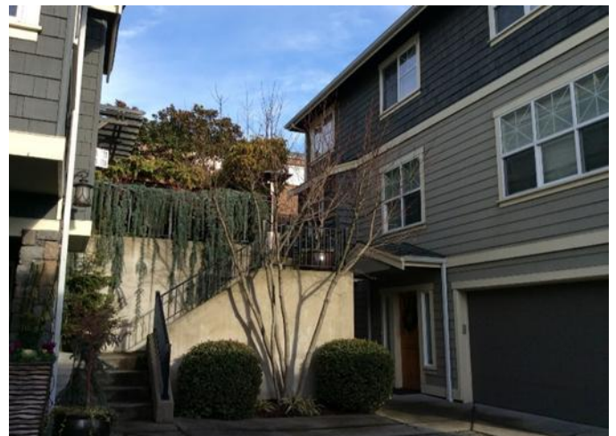
Grade 10 (TH)/Year Built 2005/TLA 2070 SF