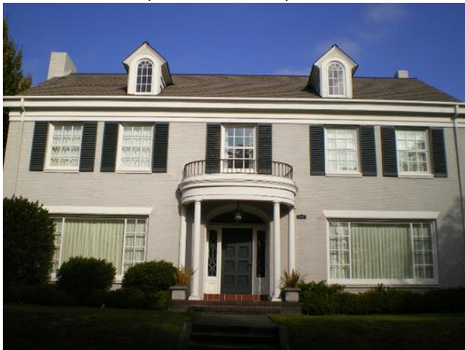
Grade 11/ Year Built 1936/ TLA 4770 SF