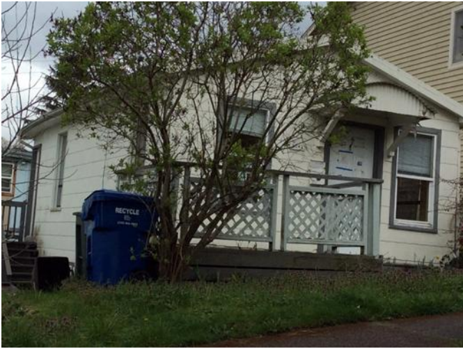
Grade 5/Year Built 1925/TLA 480 SF