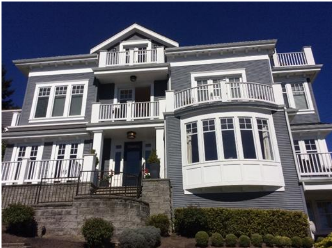
Grade 10/ Year Built 2008/ TLA 2450 SF