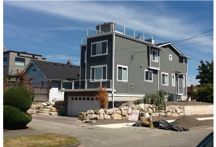
Grade 9/ Year Built 2012/ TLA 3090 SF