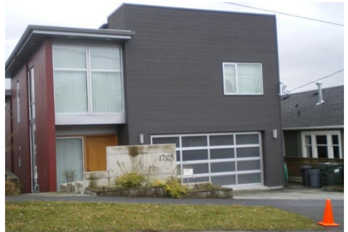
Grade 11 / Year Built 2011/ TLA 3690 SF