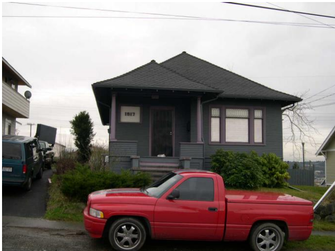
Grade 7/ Year Built 1911/ TLA 2007 SF