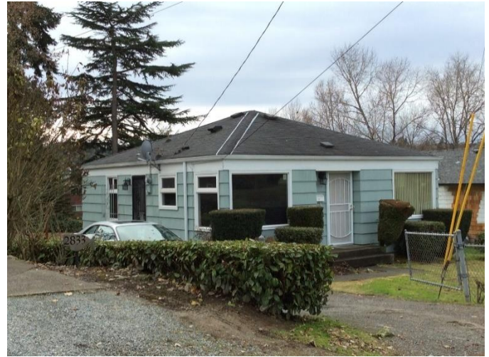
Grade 6/ Year Built 1949/ TLA 730 SF