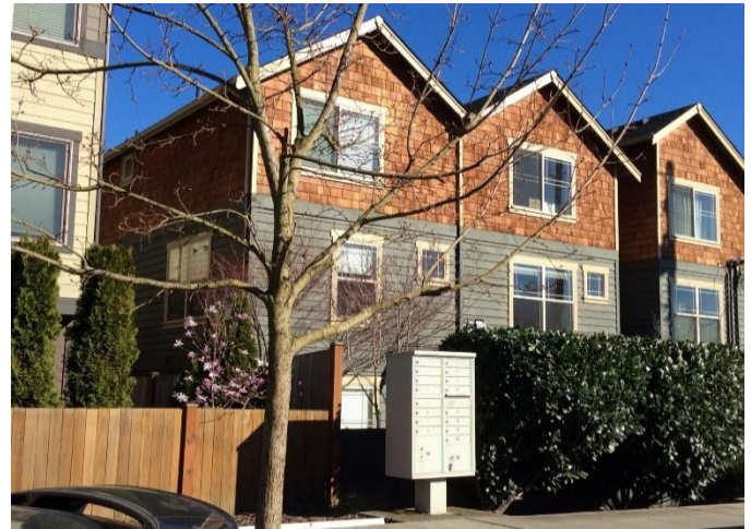
Grade 7 (TH)/ Year Built 2007/ TLA 1310 SF