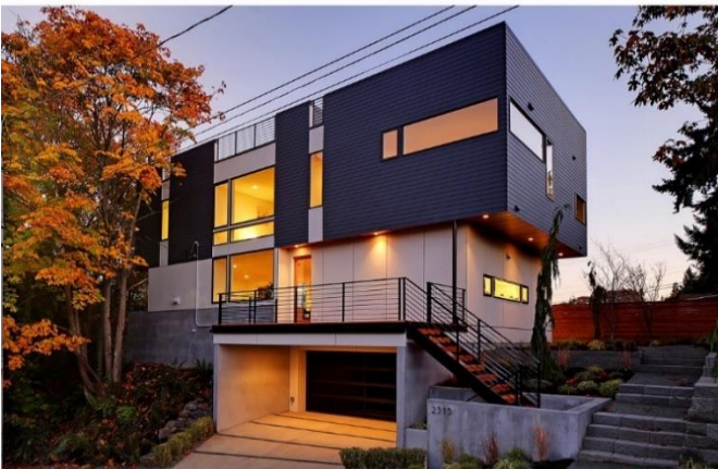
Grade 10/ Year Built 2013/ TLA 2460 SF