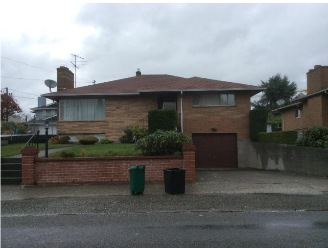
Grade 8/ Year Built 1956/ TLA 2650 SF