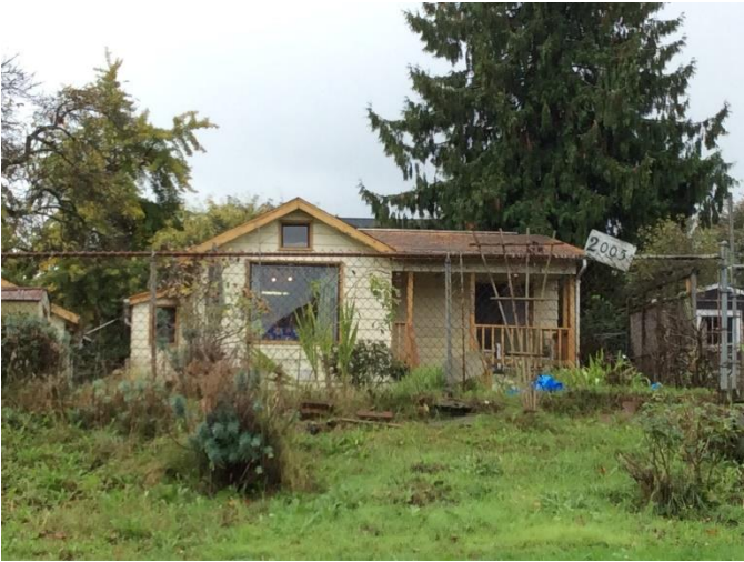
Grade 5/ Year Built 1918/ TLA 660 SF