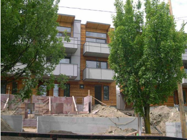
Grade 9 (TH)/ Year Built 2009/ TLA 1280 SF