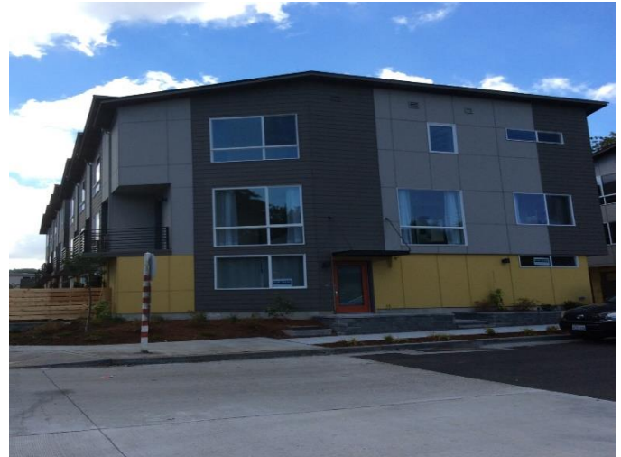
Grade 8 (TH)/ Year Built 2016/ TLA 1090 SF