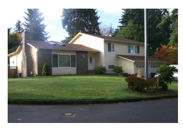
Grade 8/ Year Built 1972/ Total Living Area 2,580