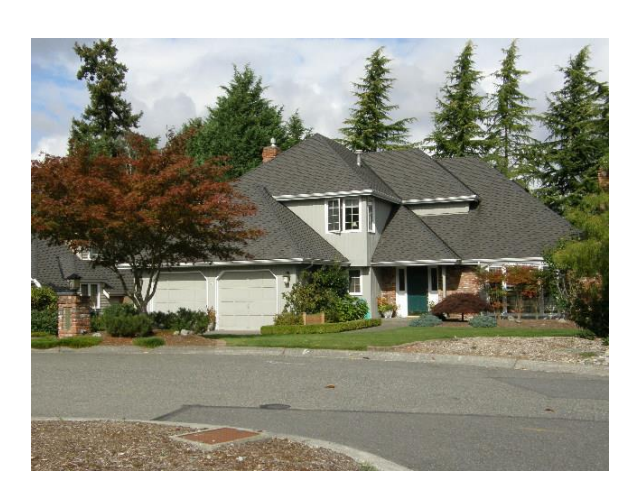
Grade 9/ Year Built 1984/ Total Living Area 2,420