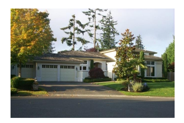
Grade 11/ Year Built 1999/ Total Living Area 5,070