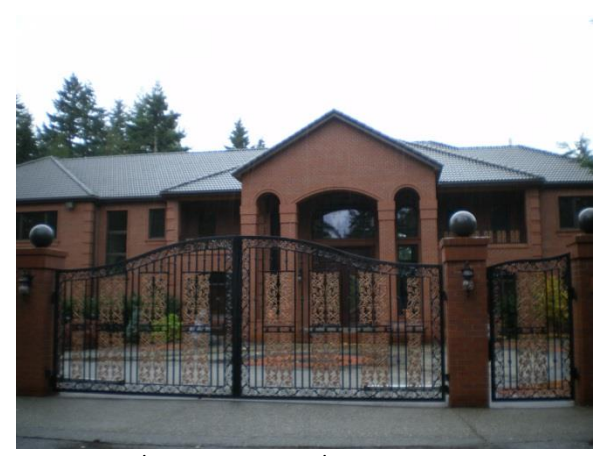
Grade 13/ Year Built 2001/ Total Living Area 13,610