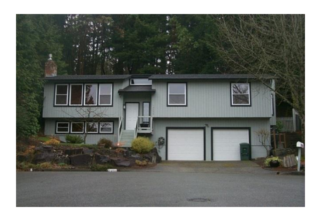
Grade 7/ Year Built 1975/ Total Living Area 1,680