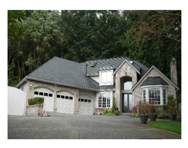
Grade 10/ Year Built 1992/ Total Living Area 3,360