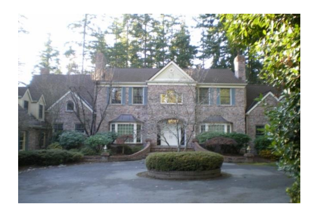
Grade 12/ Year Built 1989/ Total Living Area 8,300