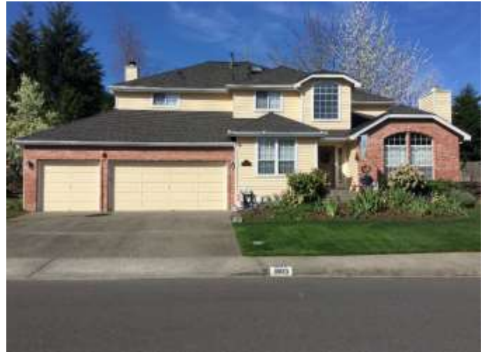
Grade 8 / Year Built 1990 / Total Living Area 2,560