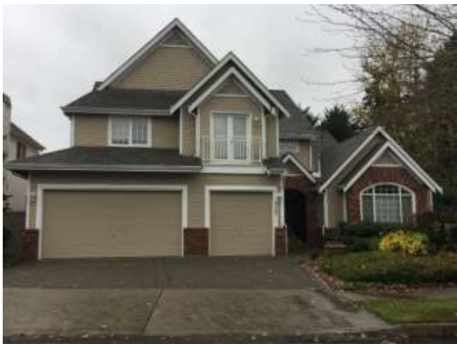
Grade 9 / Year Built 1998 / Total Living Area 3,220