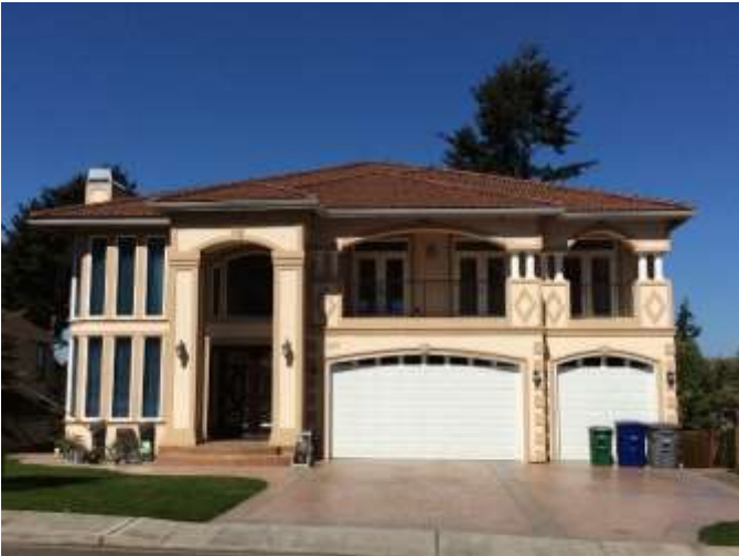
Grade 11 / Year Built 2009 / Total Living Area 7,030