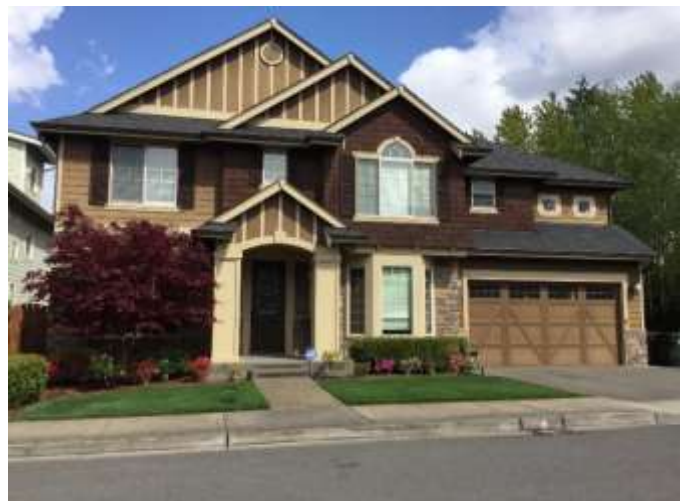
Grade 10 / Year Built 2007 / Total Living Area 3,830