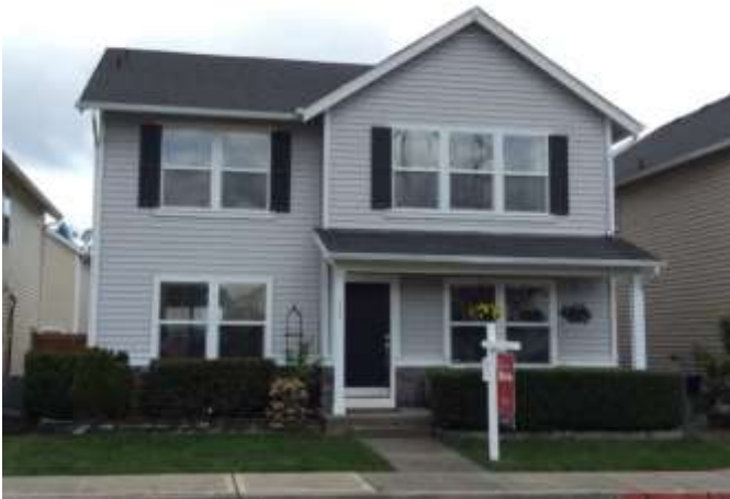
Grade 7 / Year Built 2002 / Total Living Area 2,280