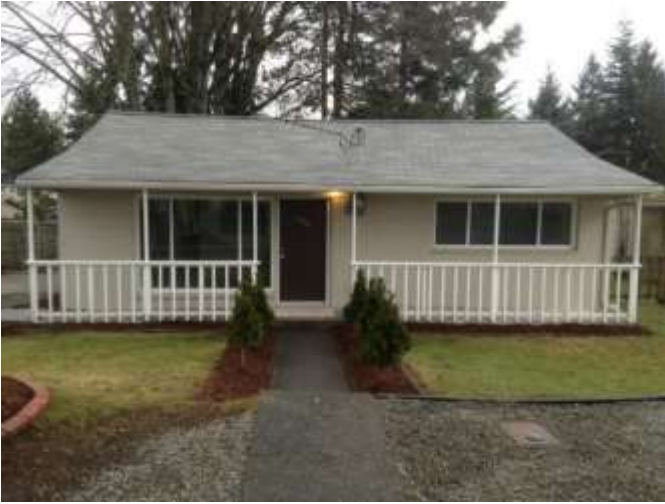
Grade 5 / Year Built 1953 / Total Living Area 700