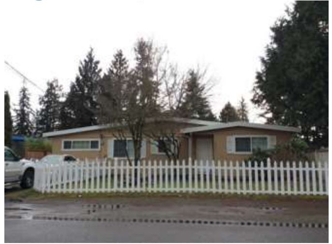
Grade 6 / Year Built 1963 / Total Living Area 1,370