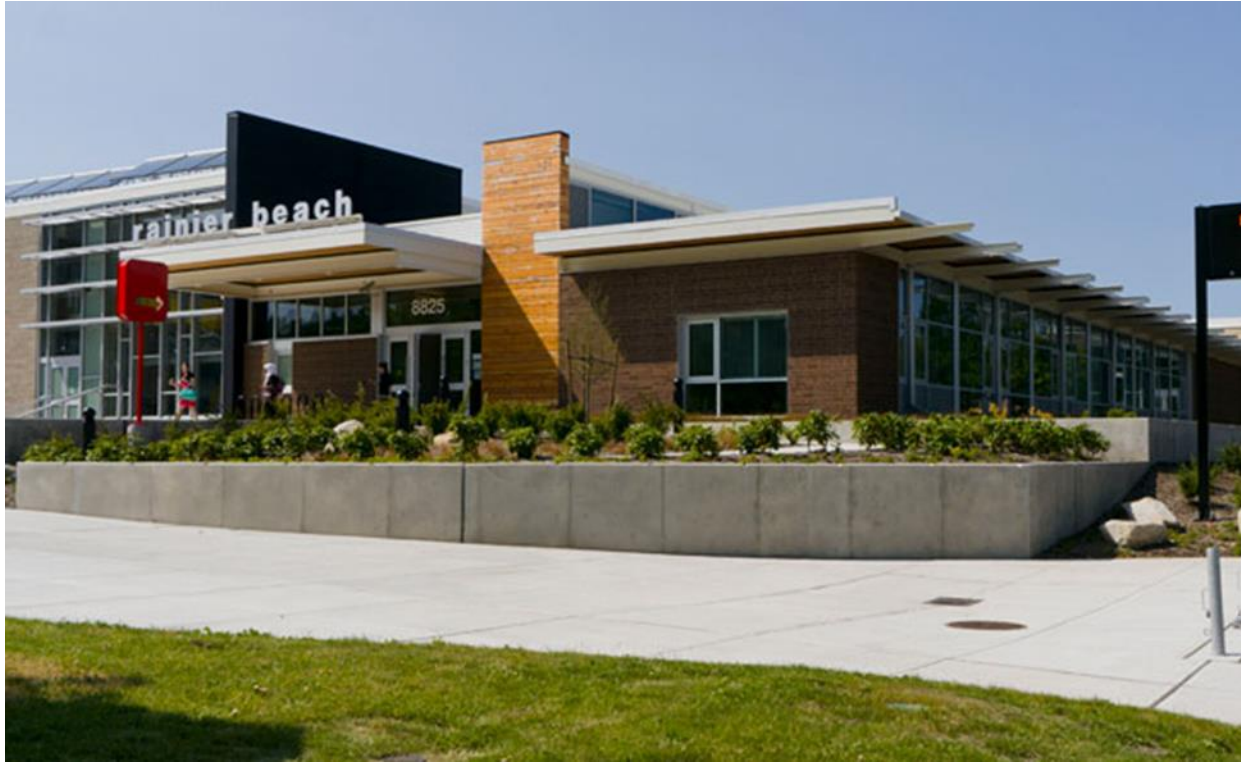
Rainier Beach Community Center