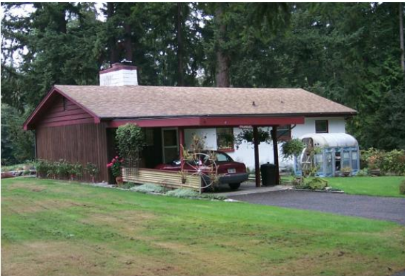
Grade 6/ Year Built 1957/ Total Living Area 1,150