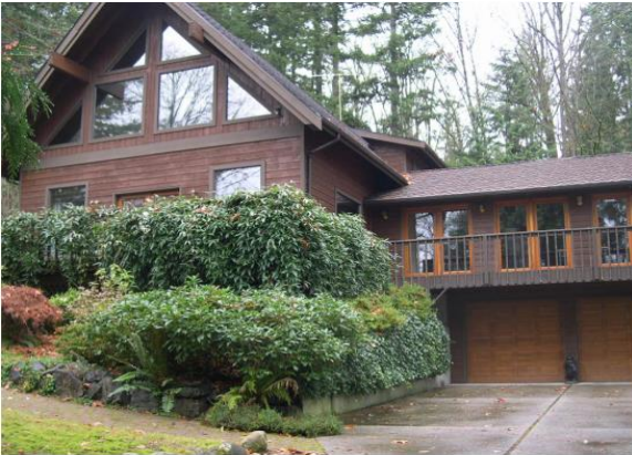
Grade 8/ Year Built 1987/ Total Living Area 2,880