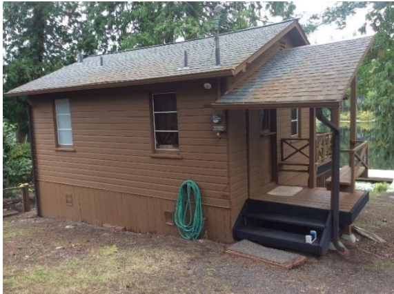
Grade 4/ Year Built 1950/ Total Living Area 320