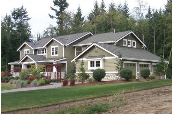
Grade10/ Year Built 2000/ Total Living Area 3,670