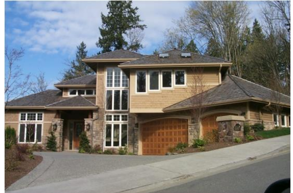
Grade 11/ Year Built 2005/ Total Living Area 5,300