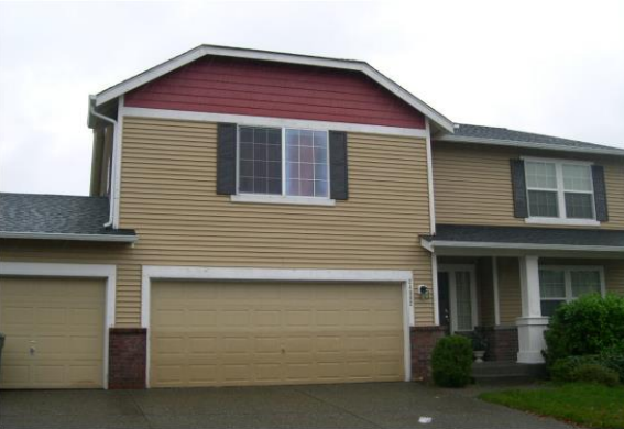
Grade 7/ Year Built 2003/ Total Living Area 3,500