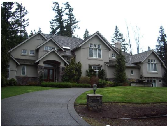
Grade 12/ Year Built 2002/ Total Living Area 5,720