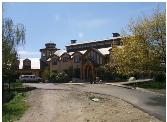
Grade 13/ Year Built 2001/ Total Living Area 10,330