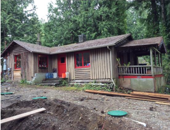
Grade 5/ Year Built 1939/ Total Living Area 1,190