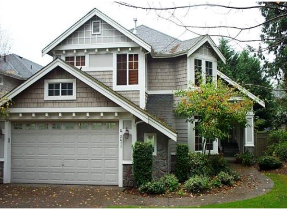
Grade 9/ Year Built 1998/ Total Living Area 2,520