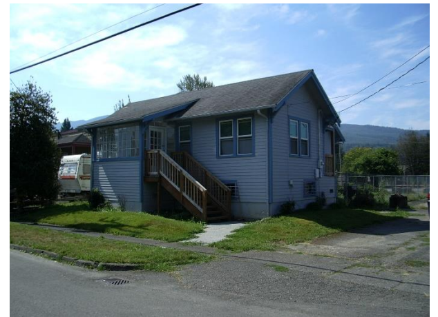
Grade 6/ Year Built 1922 renovated 1990/ Total Living Area 970sf