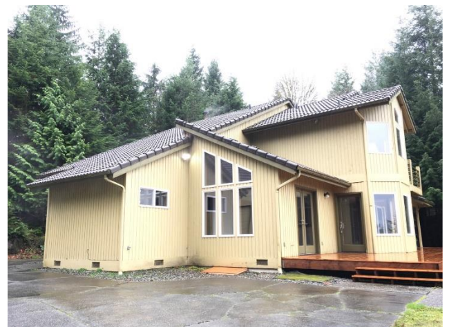
Grade 8/ Year Built 1991/ Total Living Area 2,470sf