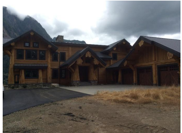
Grade 12/ Year Built 2013/ Total Living Area 5,550sf