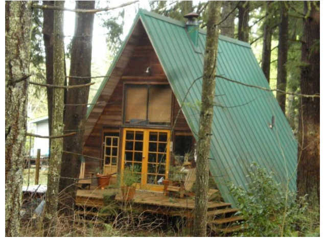
Grade 4/ Year Built 1966/ Total Living Area 530sf