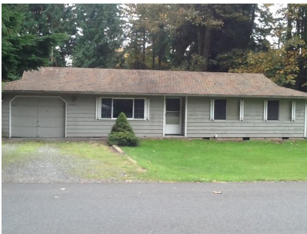
Grade 7/ Year Built 1986/ Total Living Area 1,140sf