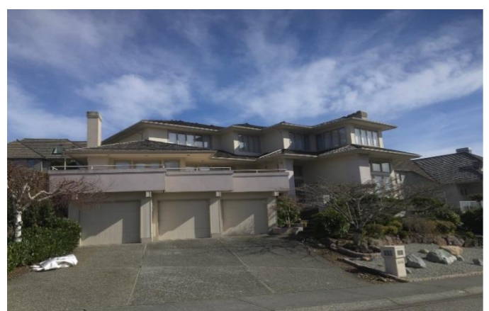
Grade 11/ Year Built 1990/ Total Living Area 3890