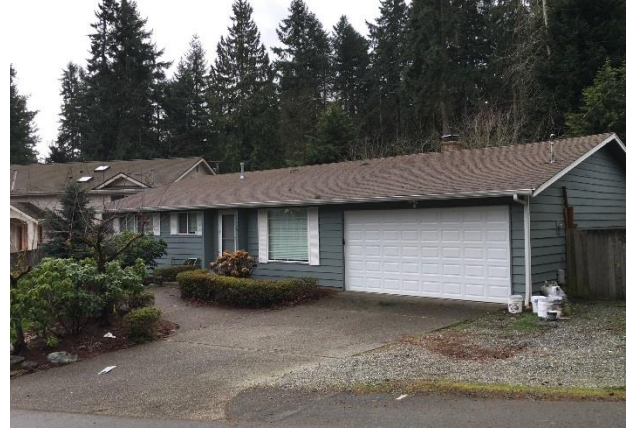
Grade 7/ Year Built 1967/ Total Living Area 1540