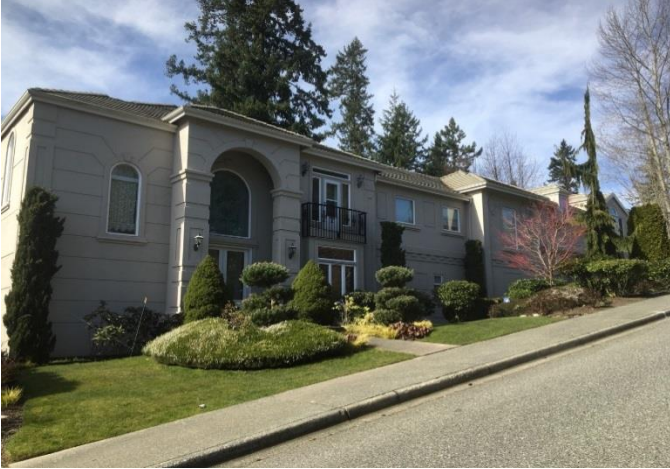
Grade 12/ Year Built 2001/ Total Living Area 6130