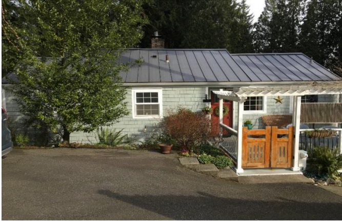
Grade 6/Year Built 1949 / Total Living Area 1780