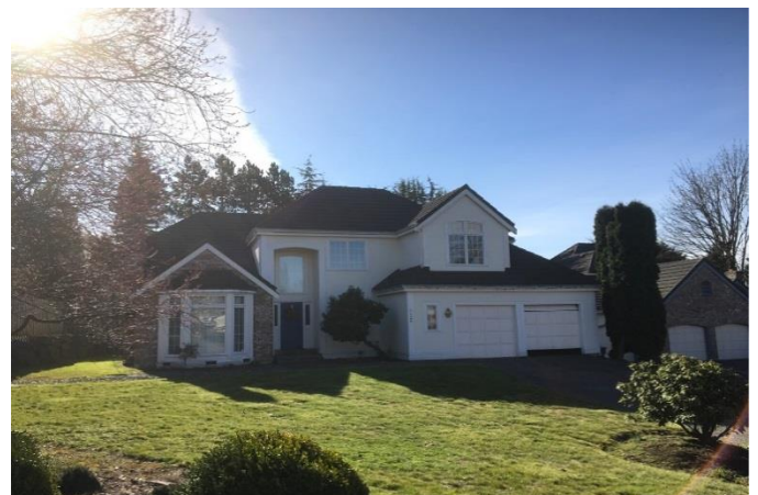
Grade 9/ Year Built 1987/ Total Living Area 2790