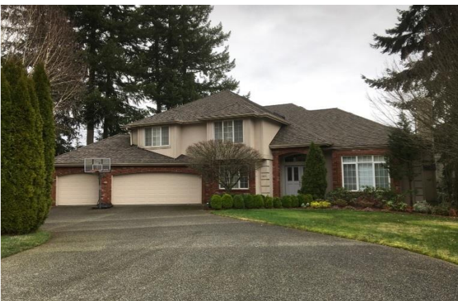
Grade 10/ Year Built 1996/ Total Living Area 4280