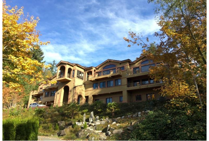
Grade 13/ Year Built 2005/ Total Living Area 7950