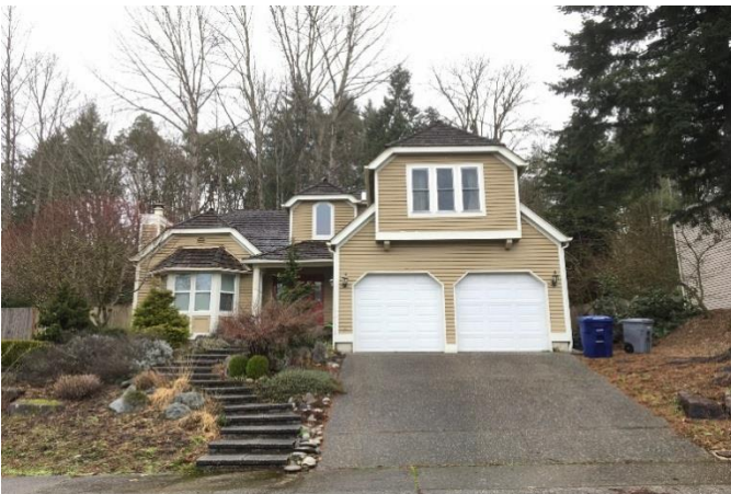
Grade 8/ Year Built 1985/ Total Living Area 2200