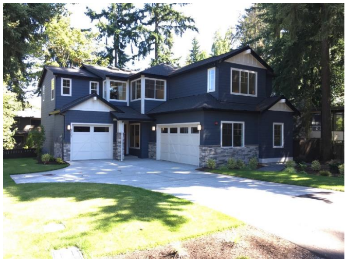
Grade 10 / Year Built 2019 / Total Living Area 4,000