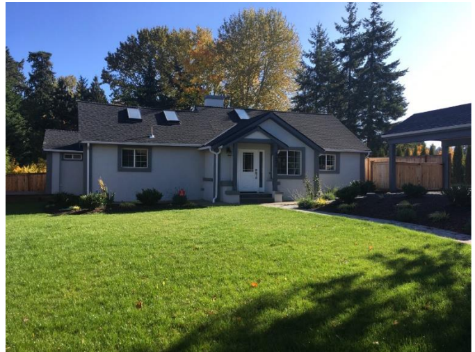
Grade 7 / Year Built 1942 / Total Living Area 1,820