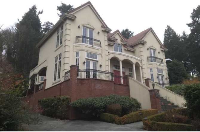
Grade 12 / Year Built 2001 / Total Living Area 7,380