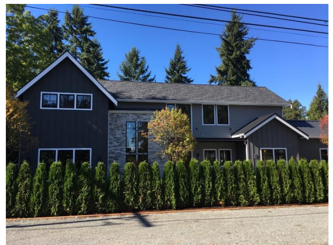
Grade 11 / Year Built 2019 / Total Living Area 4,660