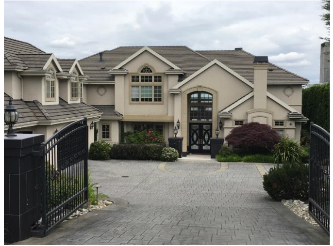
Grade 13 / Year Built 2000 / Total Living Area 7,730