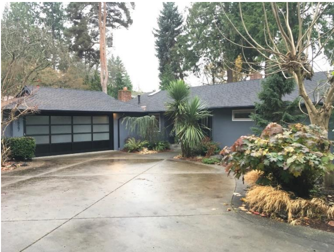
Grade 8 / Year Built 1966 / Total Living Area 1,900