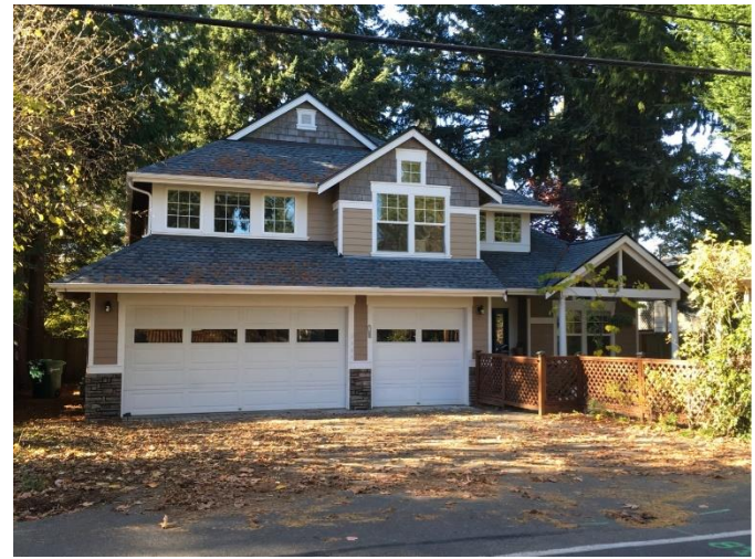
Grade 9 / Year Built 1998 / Total Living Area 2,410