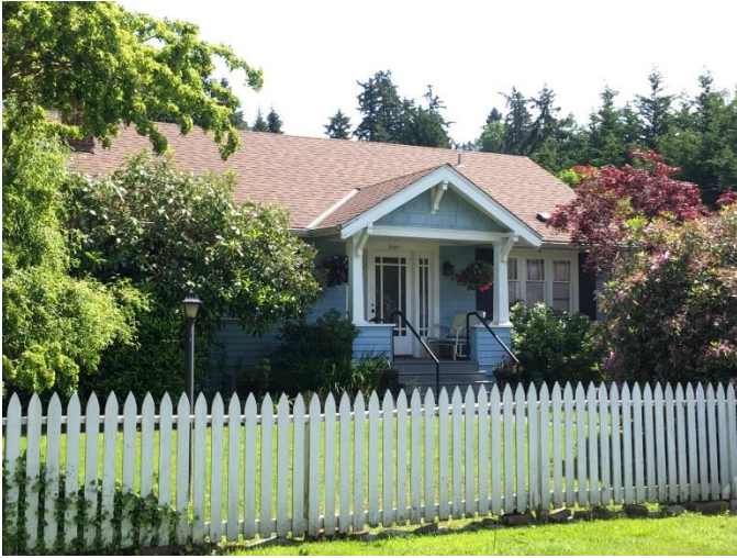
Grade 6 / Year Built 1929 / Total Living Area 910