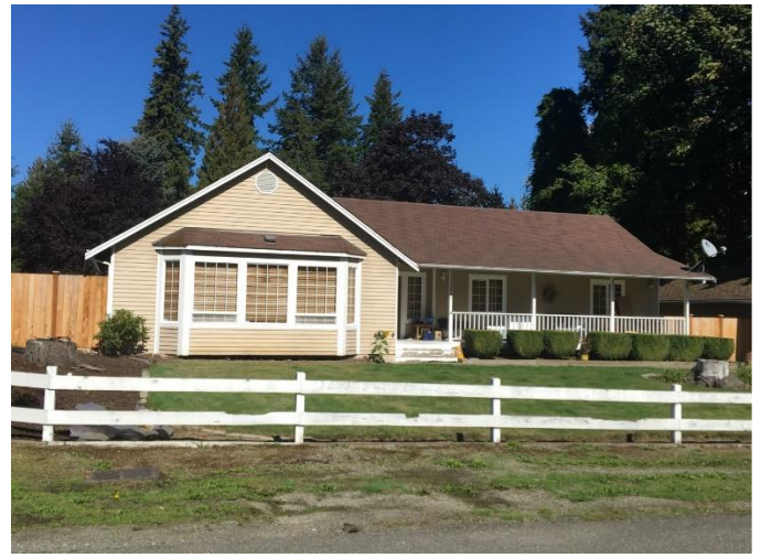
Grade 7/1992/Total Living Area 1,720