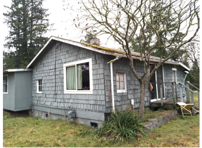
Grade 5/ 1929/Total Living Area 890