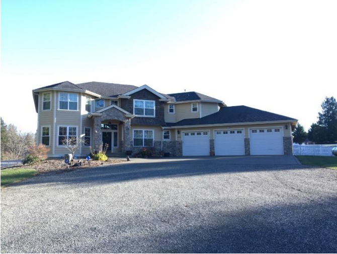
Grade 10/ 2007, Total Living Area 4,300