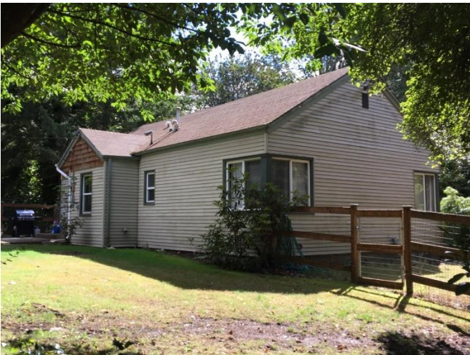
Grade 6/1945/Total Living Area 1,240