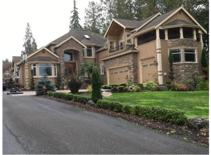
Grade 11/ 2008/ Total Living Area 4,940