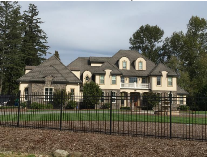
Grade 12/ 2006/ Total Living Area 6,970