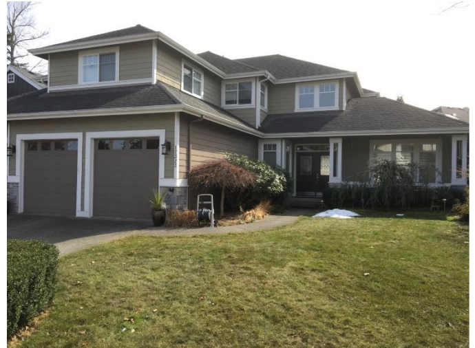
Grade 9/2000/Total Living Area 3,390