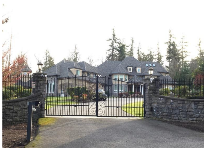
Grade 13/ 2004/ Total Living Area 8,905