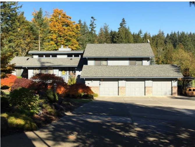
Grade 8/ 1981/Total Living Area 2,750