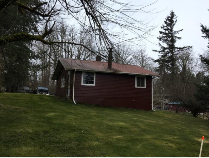
Grade 4/ 1947/Total Living Area 580