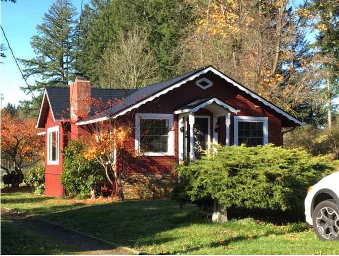
Grade 5/ 1923/ Total Living Area 920