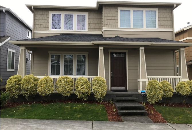
Grade 7/ 2005/ Total Living Area 1,890