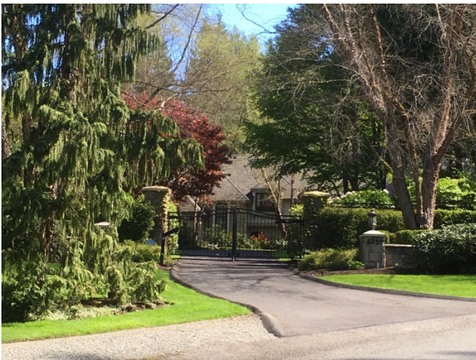
Grade 13/ 1994/ Total Living Area 6,730