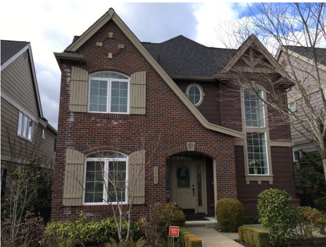
Grade 9/ 2008/ Total Living Area 2,250