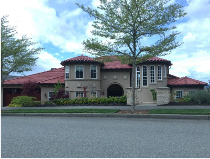
Grade 11/ 2015/ Total Living Area 4,420