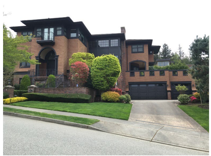
Grade 12/ 2005/ Total Living Area 5,370