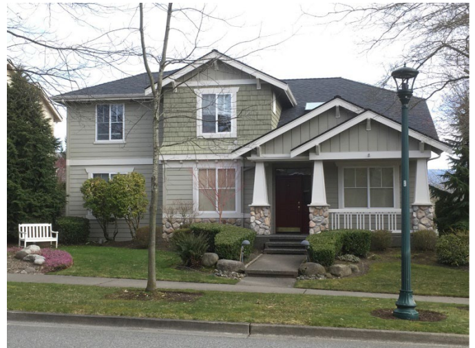
Grade 8/ 1998/ Total Living Area 2,550