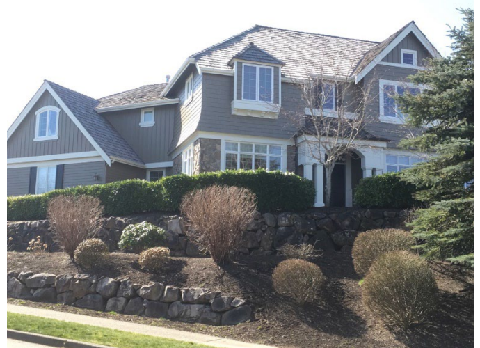
Grade 10/ 2003/ Total Living Area 3,780