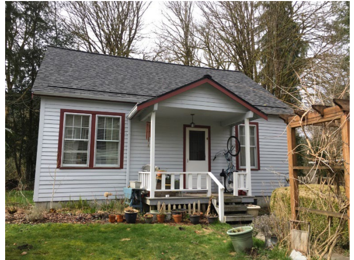
Grade 6/ 1910/ Total Living Area 1,460