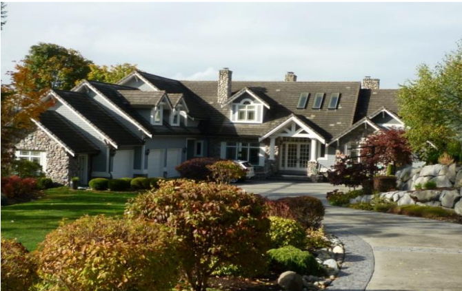
Grade 13/ Year Built 2000/ TLA 5,580