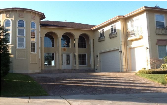
Grade 12/ Year Built 2006/ TLA 5,842