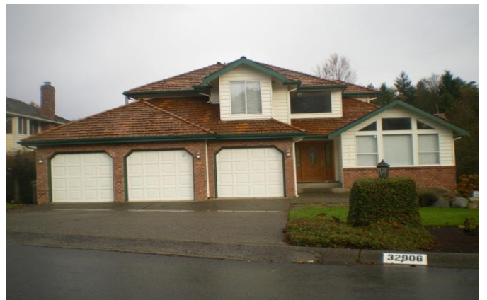
Grade 9/ Year Built 1990/ TLA 3,890