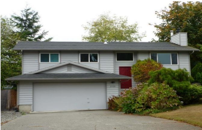
Grade 7/ Year Built 1980/ TLA 1,820