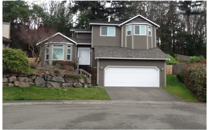
Grade 8/ Year Built 1980/ TLA 1,730