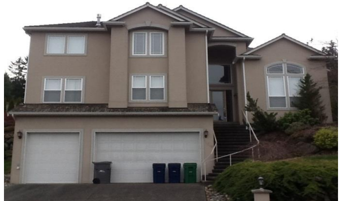
Grade 10/ Year Built 1999/ TLA 3,670