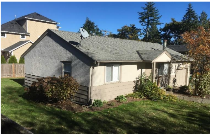
Grade 6/ Year Built 1955/ TLA 950