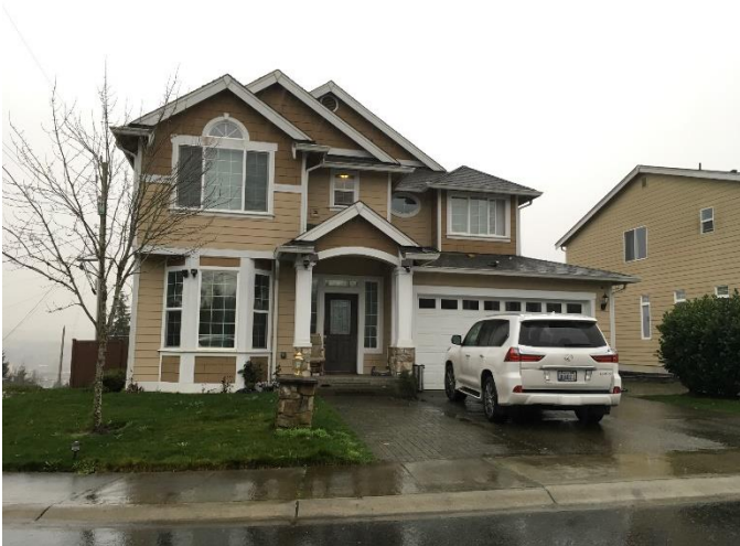
Grade 9/ 2006/ Total Living Area 2870