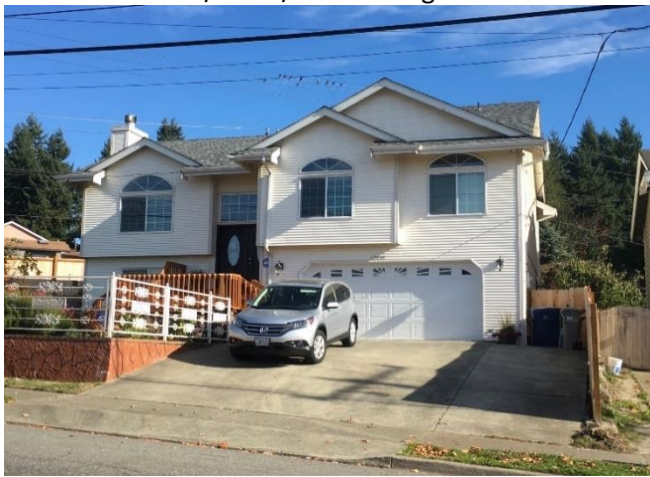
Grade 7/ 1997/ Total Living Area 2090