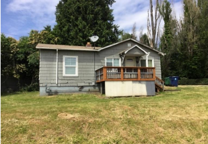
Grade 5/ 1927/ Total Living Area 720