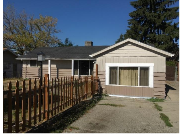
Grade 6/ 1954/ Total Living Area 1420