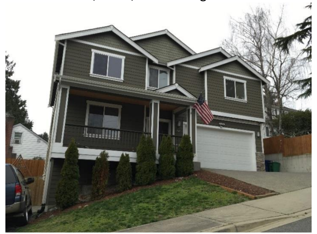
Grade 8/2012/Total Living Area 2400