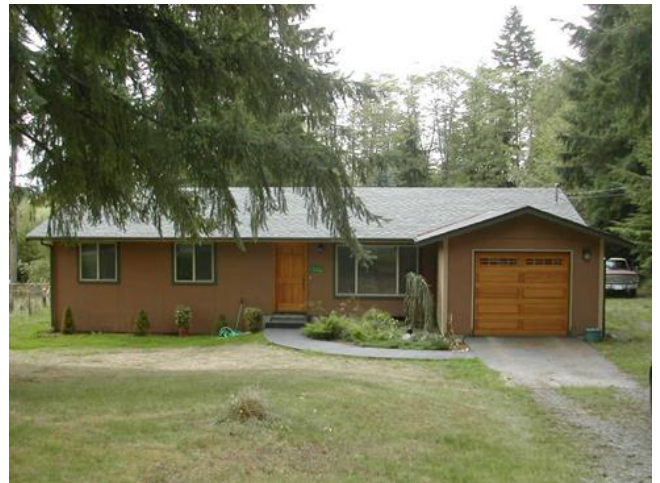
Grade 7/ Year Built 1975/ Total Living Area 1270