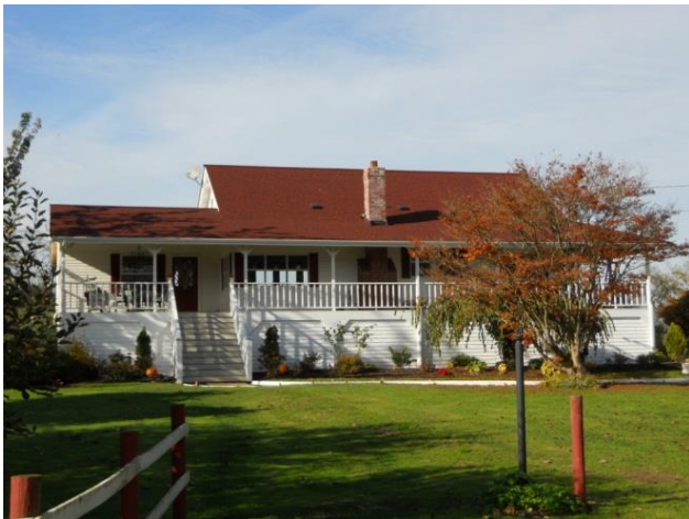
Grade 6/ Year Built 1944/ Total Living Area 1830