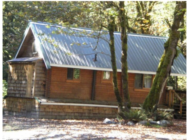
Grade 5/ Year Built 2005/ Total Living Area 540