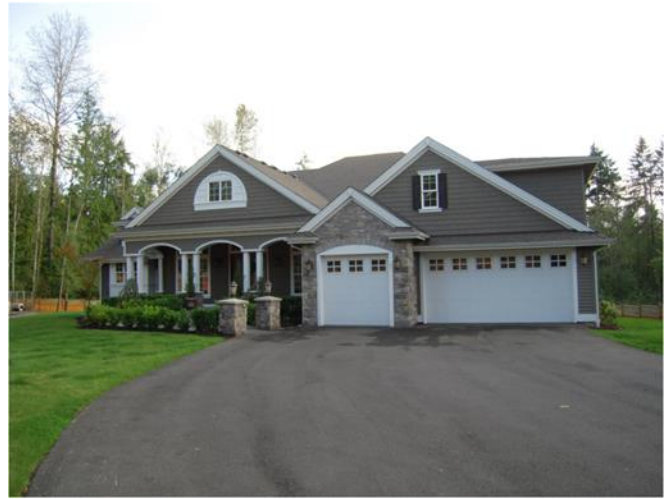
Grade 11/ Year Built 2008/ Total Living Area 4,160