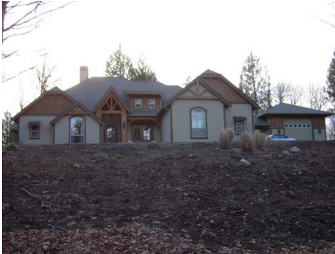
Grade 10/ Year Built 2008/Total Living Area 3680