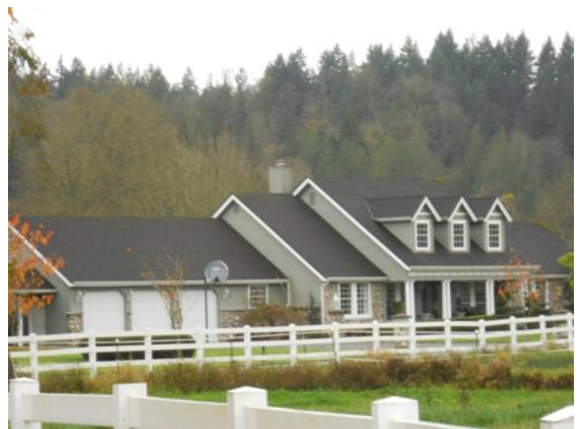
Grade 9/ Year Built 1987/ Total Living Area 3290