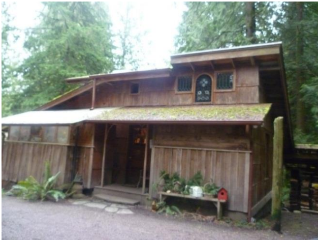
Grade 4/ Year Built 1970/ Total Living Area 1000