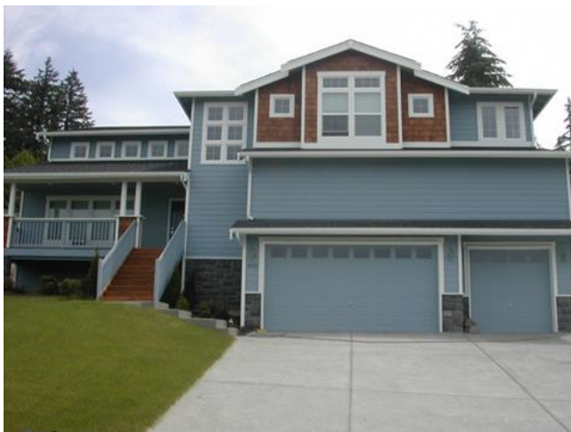
Grade 8/ Year Built 2003/ Total Living Area 3020