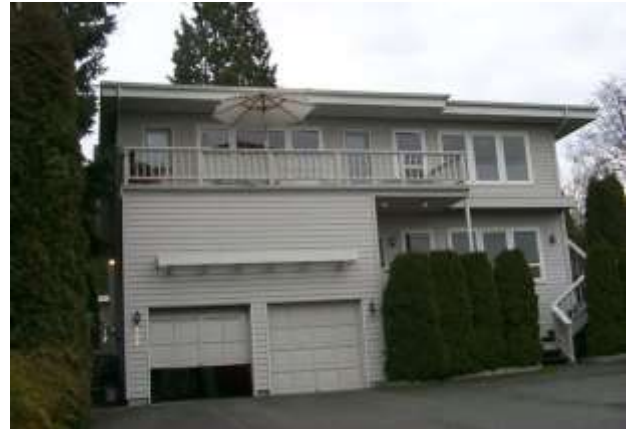
Grade 9/ Year Built 1990/ Total Living Area 3660