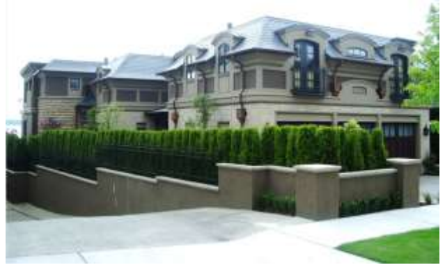
Grade 13/ Year Built 2008/ Total Living Area 7520