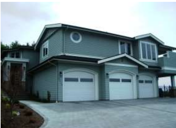
Grade 10/ Year Built 2009/ Total Living Area 4020