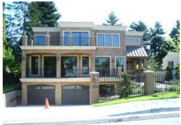
Grade 11/ Year Built 2008/ Total Living Area 4950