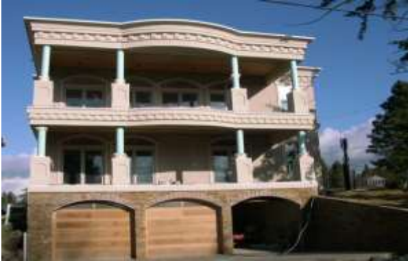
Grade 12/ Year Built 2006/ Total Living Area 5760