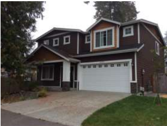
Grade 8/ Year Built 2012/ Total Living Area 2560