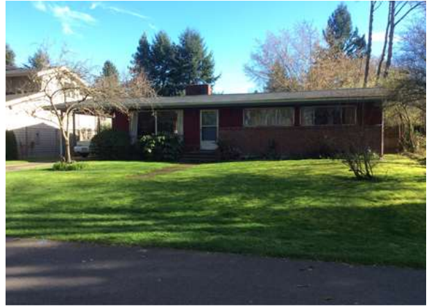
Grade 7/ Year Built 1955/ Total Living Area 1060