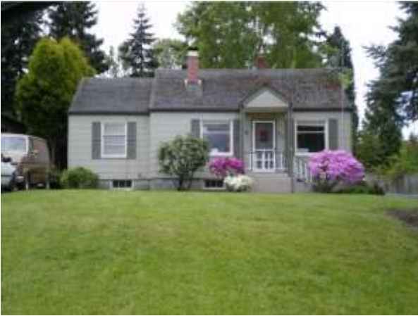
Grade 6/ Year Built 1947/ Total Living Area 1560