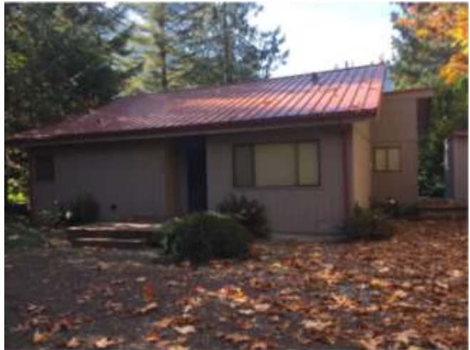
Grade 6/ Year Built 1981/ Total Living Area 1,150sf