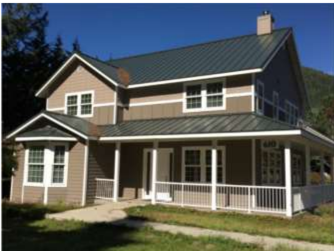
Grade 8/ Year Built 2014/ Total Living Area 2,740sf