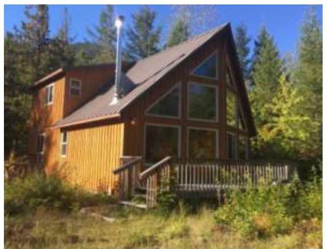
Grade 7/ Year Built 2003/ Total Living Area 1,460sf