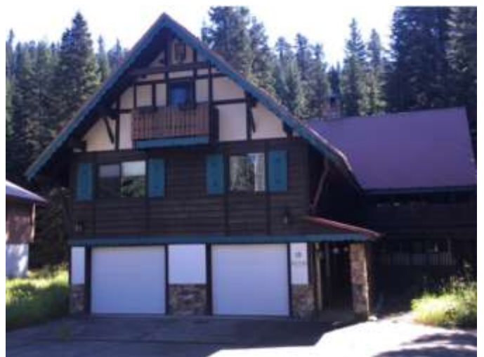
Grade 9/ Year Built 1967/ Total Living Area 4,330sf