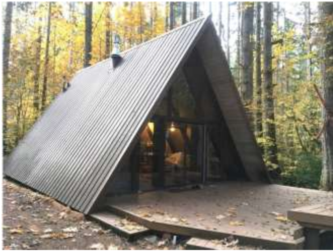
Grade 4 / Year Built 1970/ Total Living Area 660