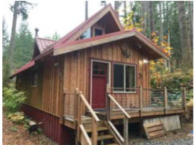
Grade 5/ Year Built 1971/ Total Living Area 970