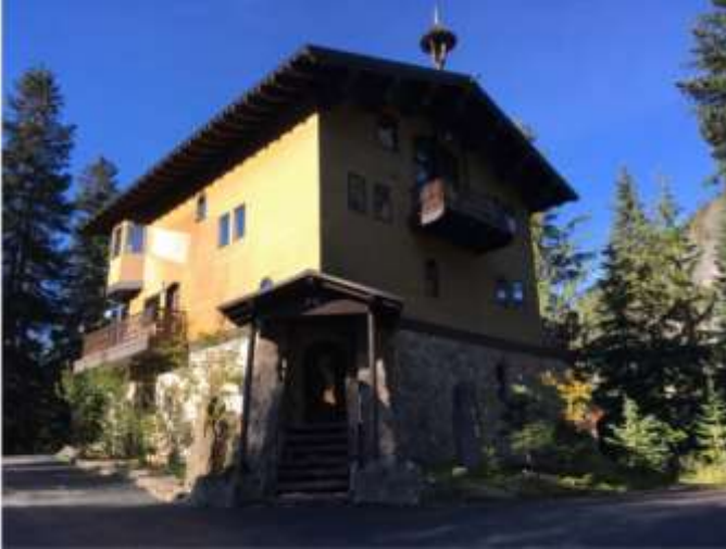
Grade 10/ Year Built 1981/ Total Living Area 3,630sf