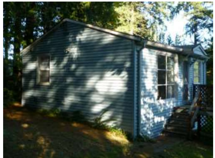
Grade 5/ Year Built 1948/ Total Living Area 510sf