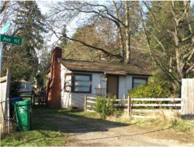
Grade 4/ Year Built 1949/ Total Living Area 360sf