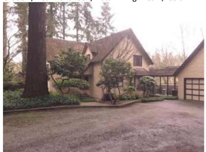
Grade 9/ Year Built 1980/ Total Living Area 2,340sf