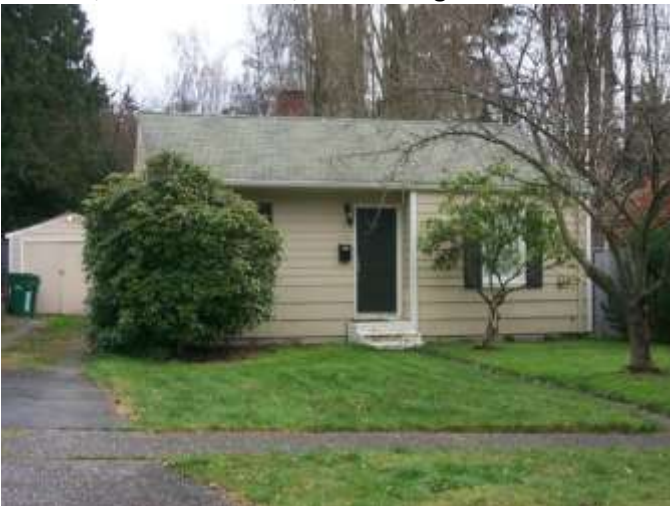
Grade 6/ Year Built 1943/ Total Living Area 800sf