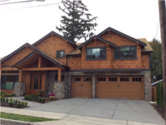
Grade 10/ Year Built 2015/ Total Living Area 3,190sf