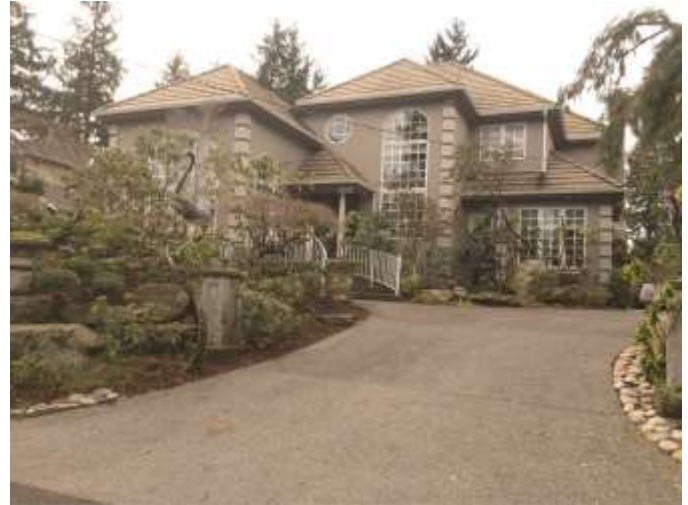
Grade 11/ Year Built 1988/ Total Living Area 3,250sf