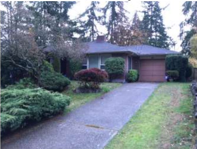
Grade 8/ Year Built 1951/ Total Living Area 1,960sf