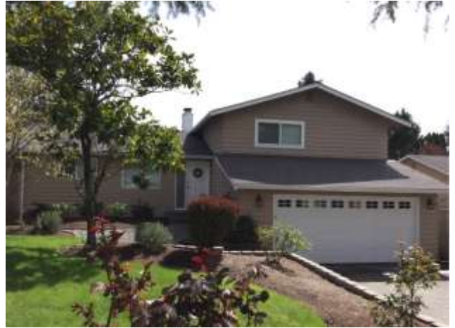
Grade 7 / Year Built 1972 / Total Living Area 1970 SF