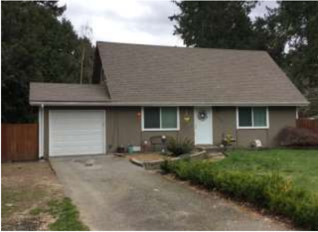
Grade 6 / Year Built 1970 / Total Living Area 750 SF