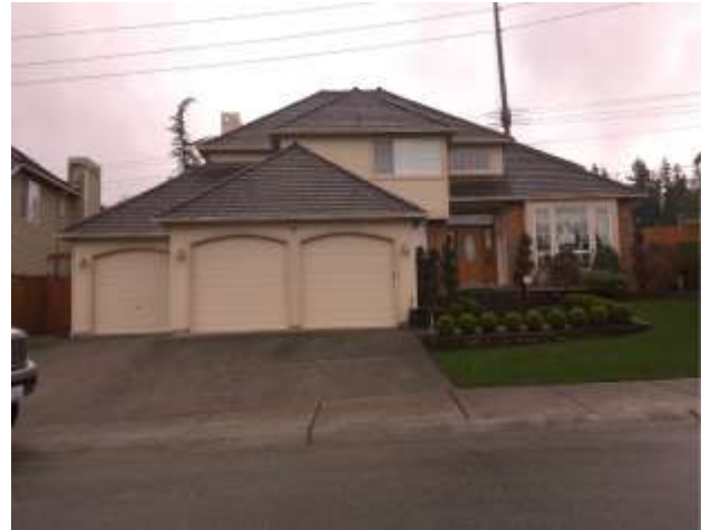
Grade 9 / Year Built 1993 / Total Living Area 2620 SF