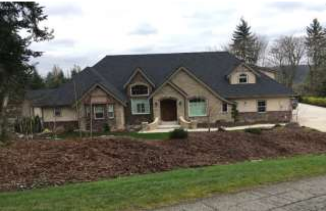
Grade 10 / Year Built 2016 / Total Living Area 3760 SF