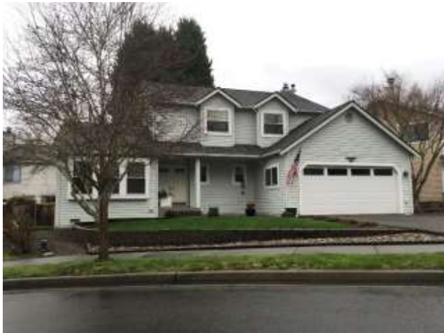
Grade 8 / Year Built 1990 / Total Living Area 1800 SF