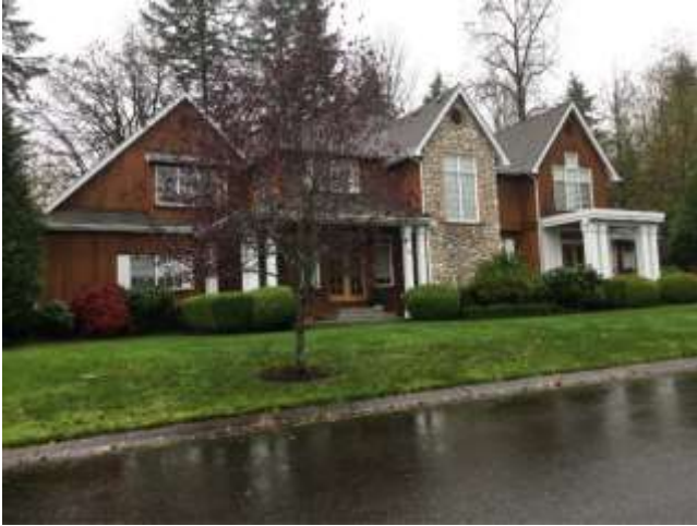
Grade 10/ Year Built 2000/ Total Living Area 4,040