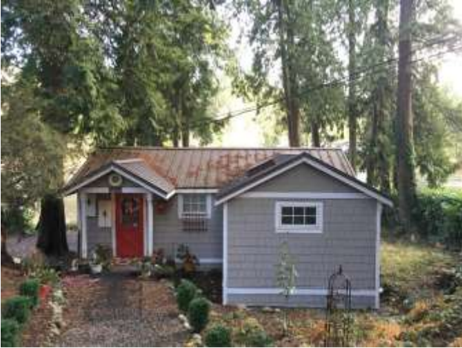
Grade 4/ Year Built 1929/ Total Living Area 720