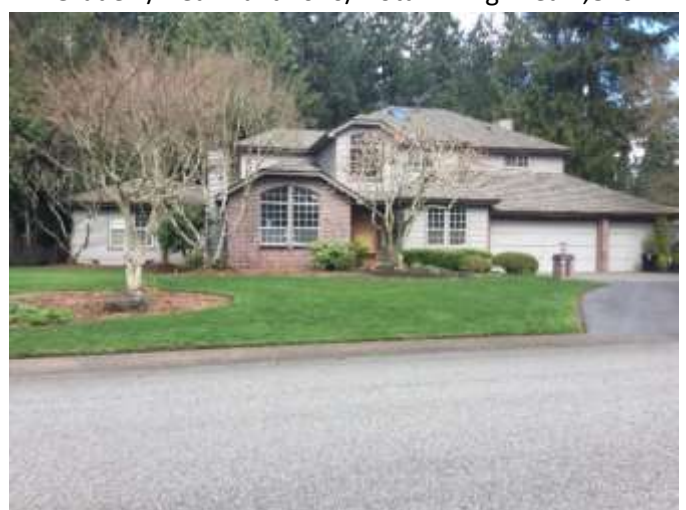
Grade 9/ Year Built 1989/ Total Living Area 2,920