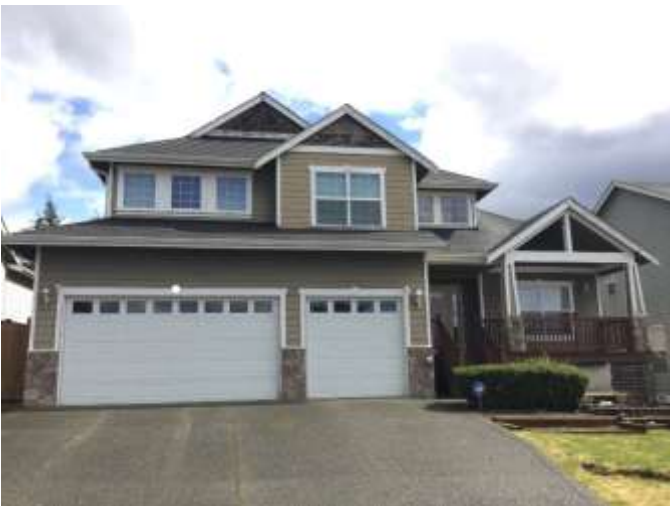
Grade 8/ Year Built 2003/ Total Living Area 2,530