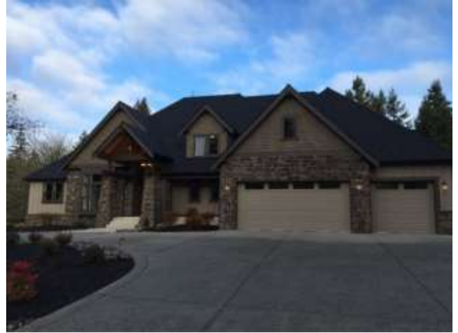
Grade 11/ Year Built 2016/ Total Living Area 4,440