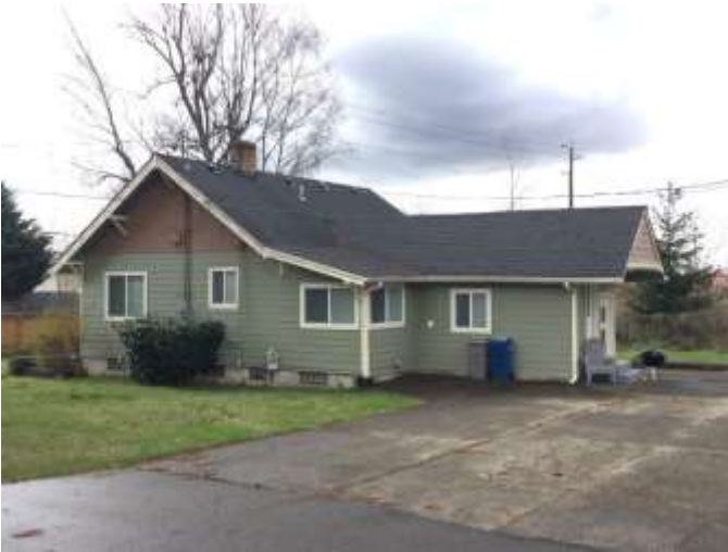
Grade 6/ Year Built 1929/ Total Living Area 1,090