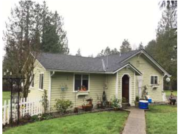
Grade 5/ Year Built 1931/ Total Living Area 1,100