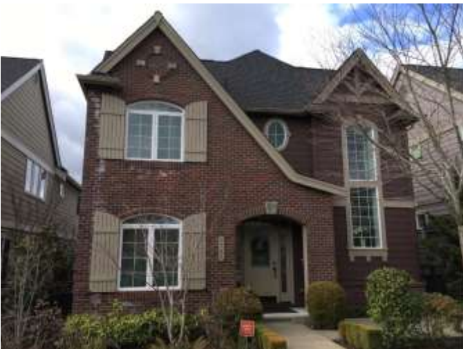
Grade 9/ 2008/ Total Living Area 2,250