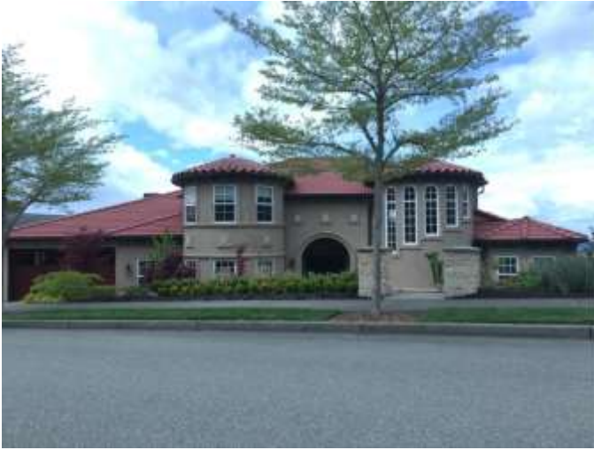
Grade 11/ 2015/ Total Living Area 4,420