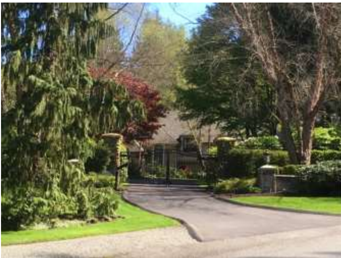
Grade 13/ 1994/ Total Living Area 6,730