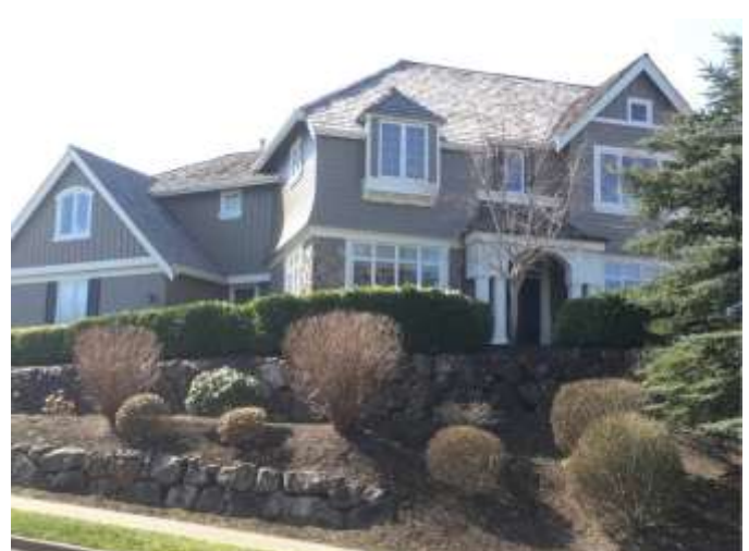
Grade 10/ 2003/ Total Living Area 3,780