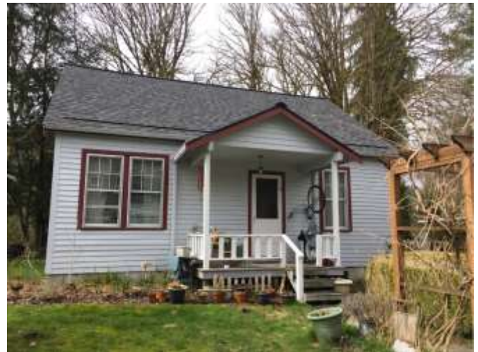
Grade 6/ 1910/ Total Living Area 1,460