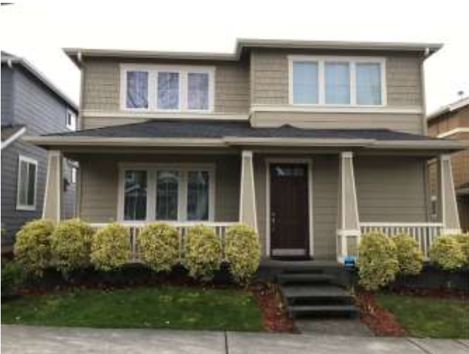
Grade 7/ 2005/ Total Living Area 1,890