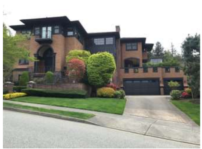
Grade 12/ 2005/ Total Living Area 5,370