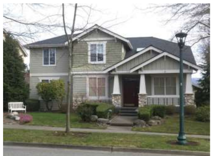
Grade 8/ 1998/ Total Living Area 2,550