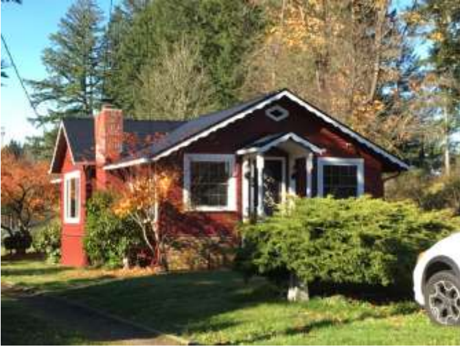
Grade 5/ 1923/ Total Living Area 920