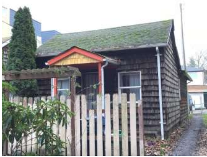
Grade 5/ Year Built 1913/ Total Living 594