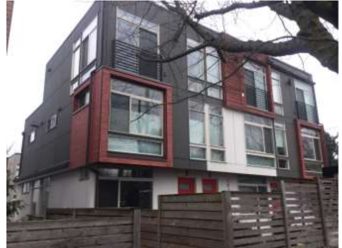
Grade 9/ Year Built 2017/ Total Living 1,750