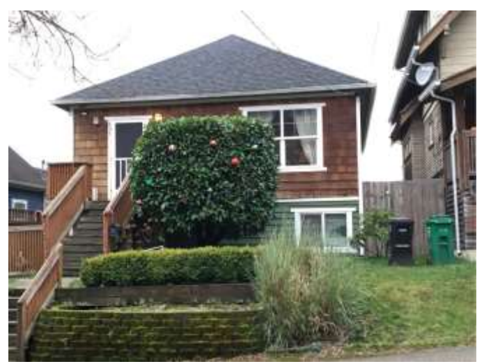
Grade 6/ Year Built 1914/ Total Living 2,350