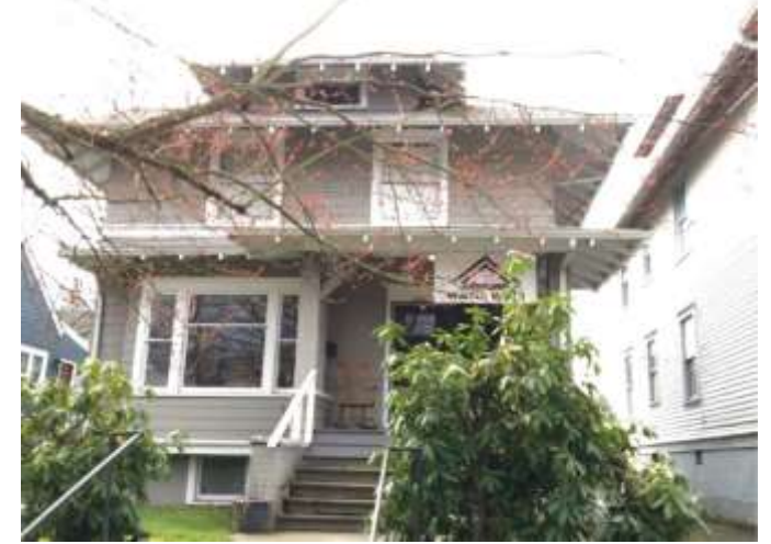
Grade 8/ Year Built 1909/ Total Living 1,730