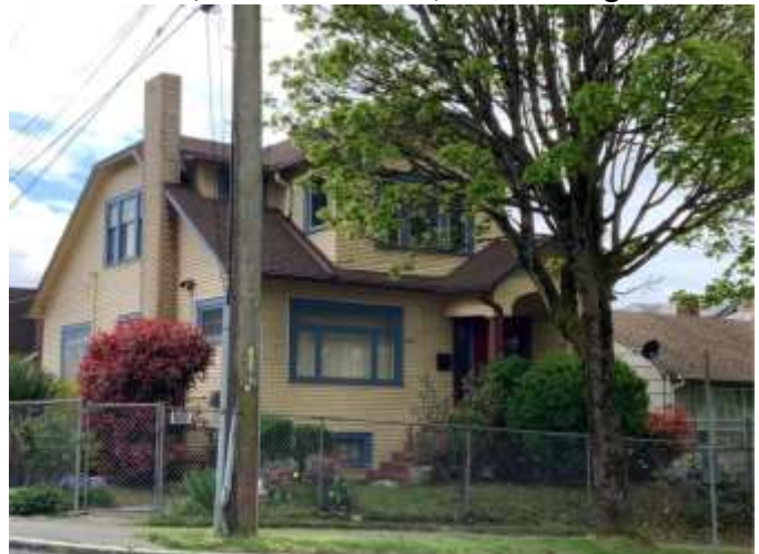
Grade 7/ Year Built 1925/ Total Living 1,510