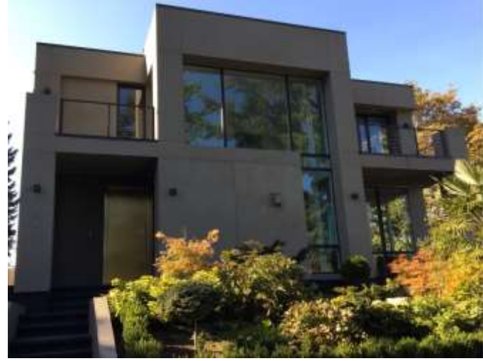
Grade 11/ Year Built 2016/ Total Living 3,440

Area Error! Reference source not found. 2021 Area Information