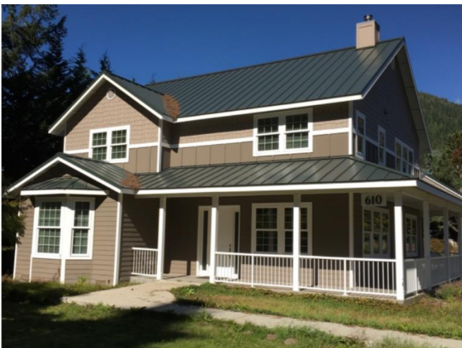
Grade 8/ Year Built 2014/ Total Living Area 2,740sf.