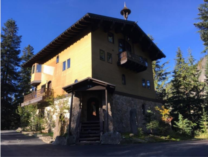
Grade 10/ Year Built 1981/ Total Living Area 3,630sf.