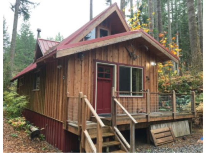
Grade 5/ Year Built 1971/ Total Living Area 970