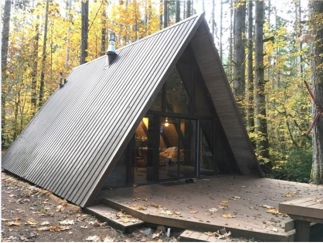
Grade 4 / Year Built 1970/ Total Living Area 660