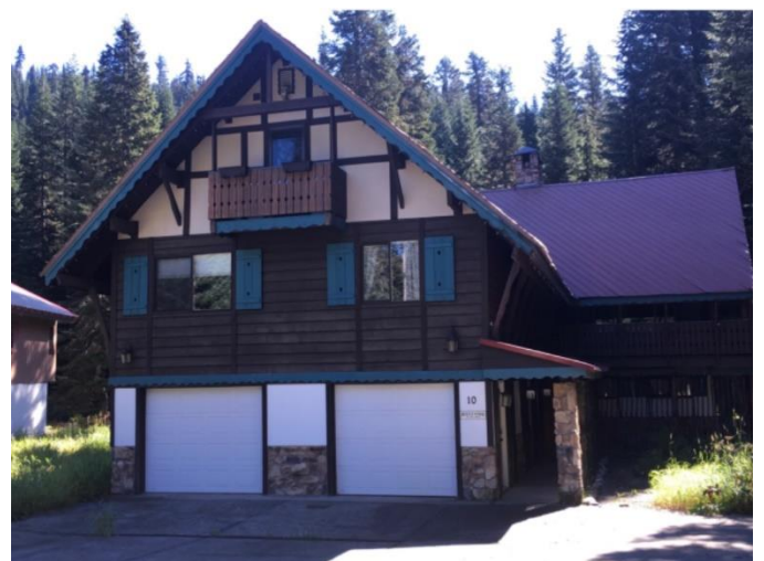
Grade 9/ Year Built 1967/ Total Living Area 4,330sf.