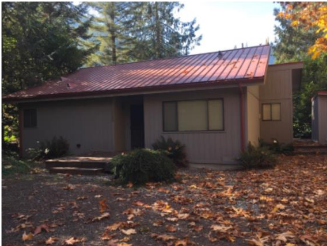
Grade 6/ Year Built 1981/ Total Living Area 1,150sf