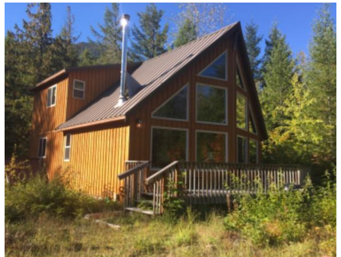
Grade 7/ Year Built 2003/ Total Living Area 1,460sf