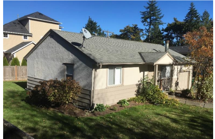
Grade 6/ Year Built 1955/ TLA 950