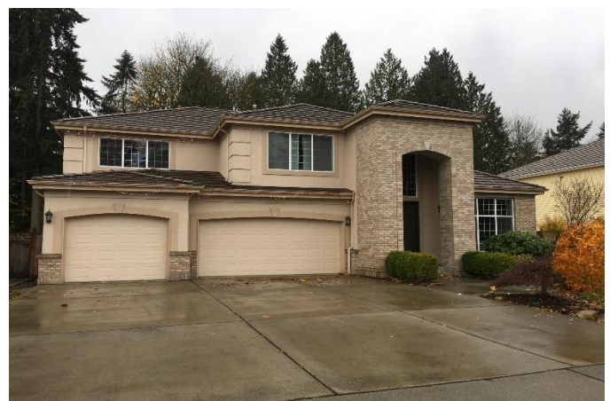
Grade 10/ Year Built 2000/ TLA 3,320