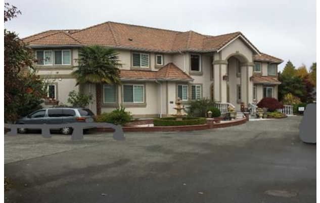
Grade 12/ Year Built 2002/ TLA 7,980