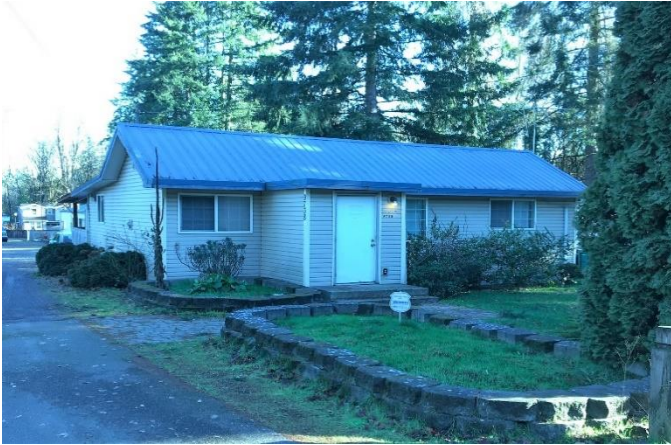
Grade 5/ Year Built 1942/ TLA 1,090