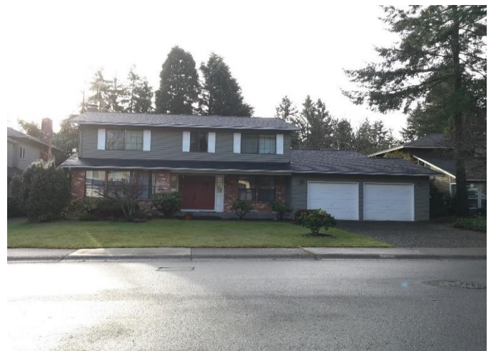
Grade 8/ Year Built 1982/ TLA 2,360