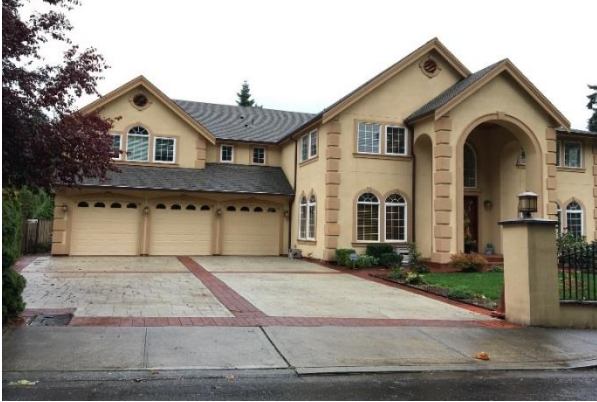
Grade 11/ Year Built 2006/TLA 4,570