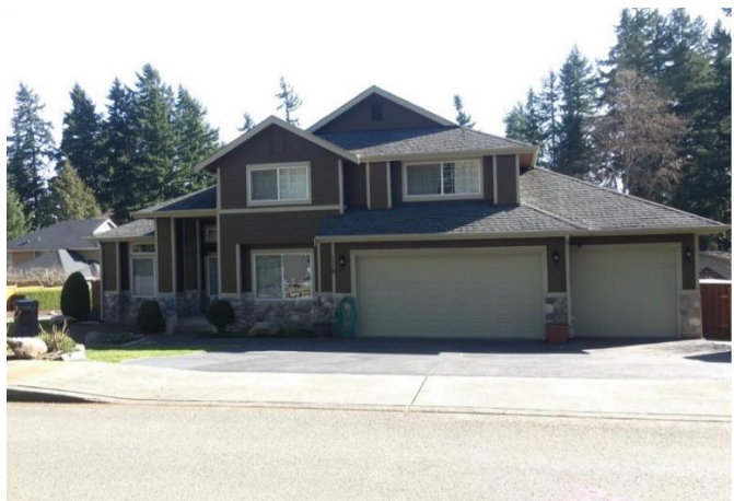
Grade 9/ Year Built 1996/ 2,450