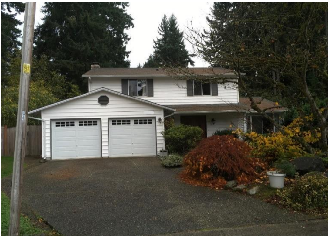
Grade 7/ Year Built 1976/ TLA 1,810