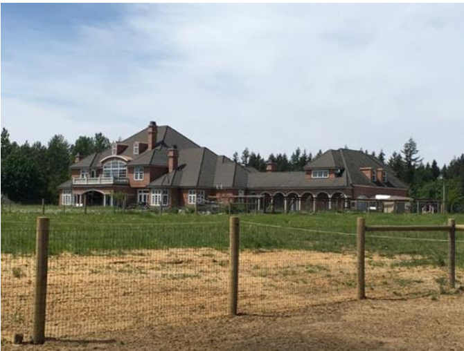
Grade 13 / Year Built 2005 / Total Living Area 9,990