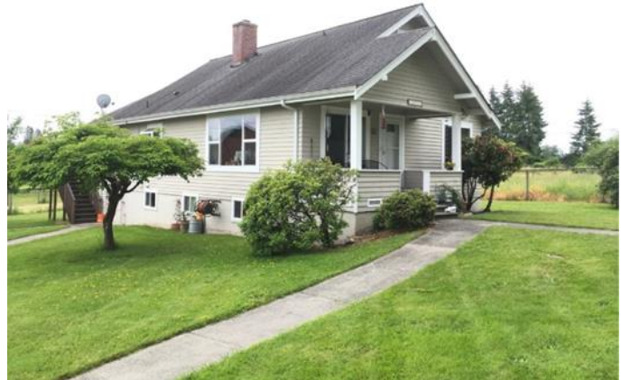
Grade 6 / Year Built 1929 / Total Living Area 1,560