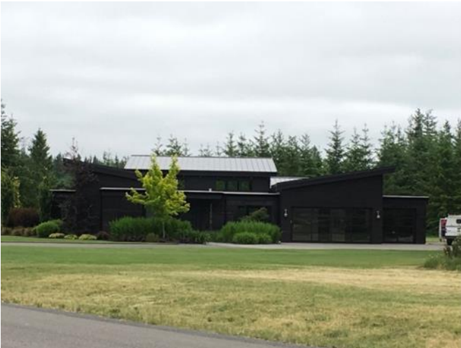
Grade 11 / Year Built 2015 / Total Living Area 3,040