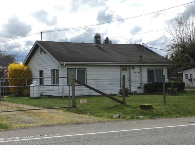
Grade 5 / Year Built 1958 / Total Living Area 1,290