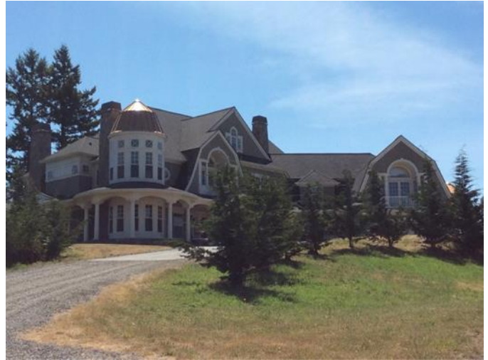
Grade 12 / Year Built 2007 / Total Living Area 8,220