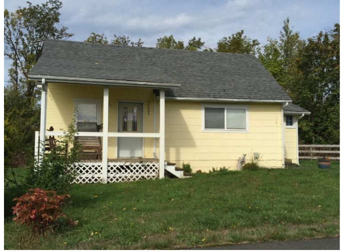
Grade 4 / Year Built 1925 / Total Living Area 620