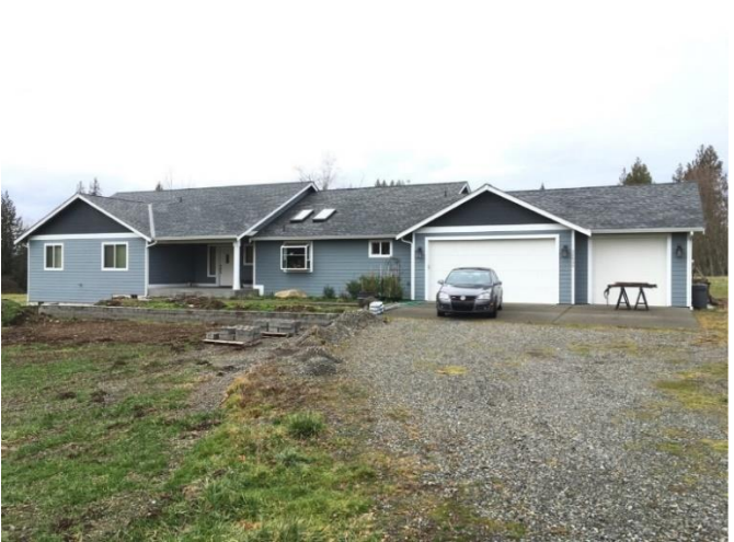
Grade 7 / Year Built 2014 / Total Living Area 2,190