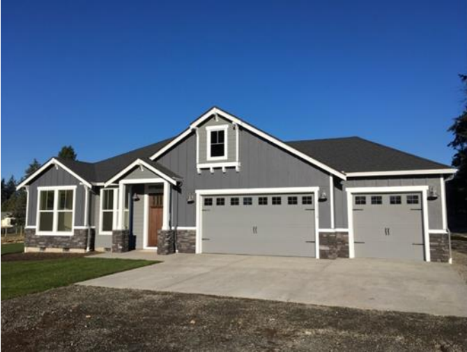
Grade 9 / Year Built 2018 / Total Living Area 2,260