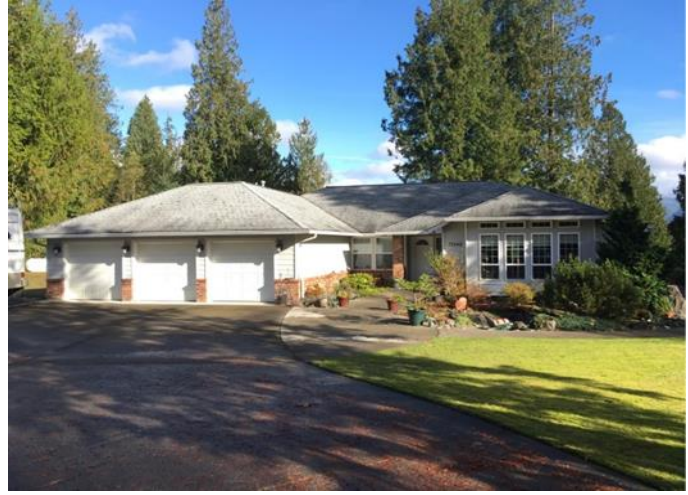
Grade 8 / Year Built 2002 / Total Living Area 2,230