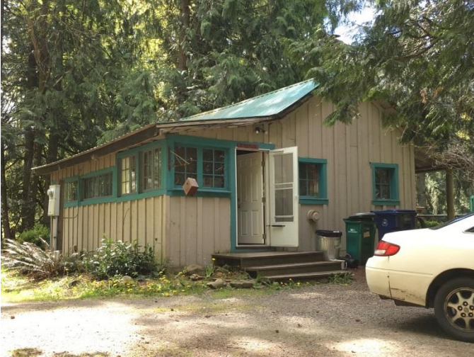
Grade 3 / Year Built 1933 / Total Living Area 530