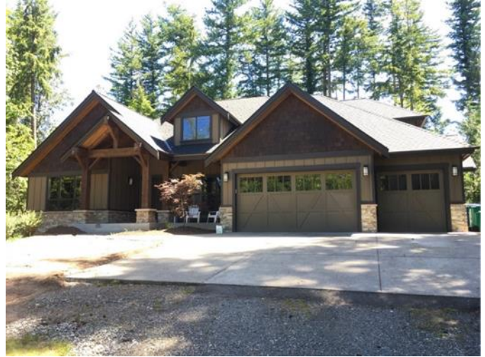
Grade 10 / Year Built 2016 / Total Living Area 3,210