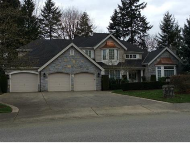
Grade 11/ Year Built 2000/ Total Living Area 3,760