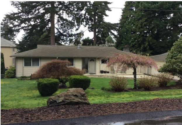
Grade 7/ Year Built 1963/ Total Living Area 2,700