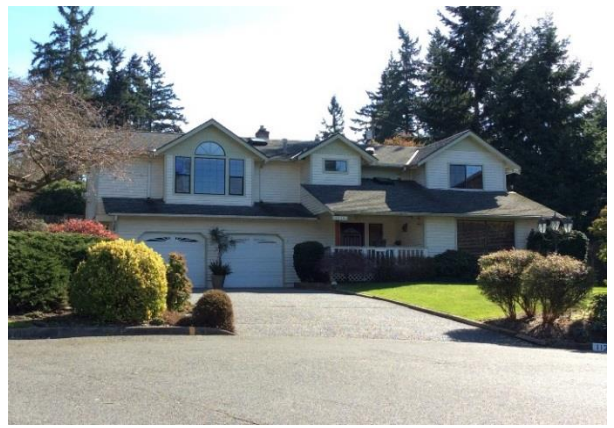
Grade 8/ Year Built 1983/ Total Living Area 2,270