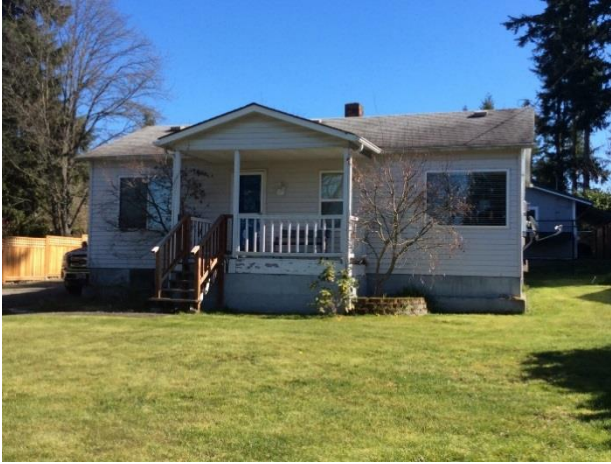
Grade 5/ Year Built 1942/ Total Living Area 710