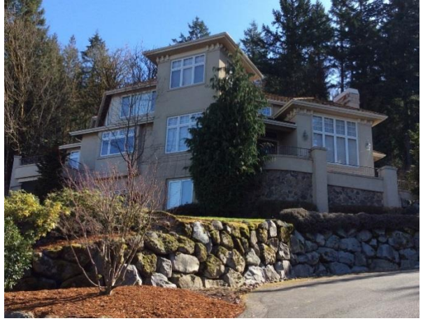
Grade 12/ Year Built 2000/ Total Living Area 4,690