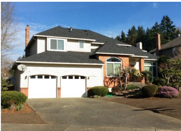
Grade 9/ Year Built 1990/ Total Living Area 2,360