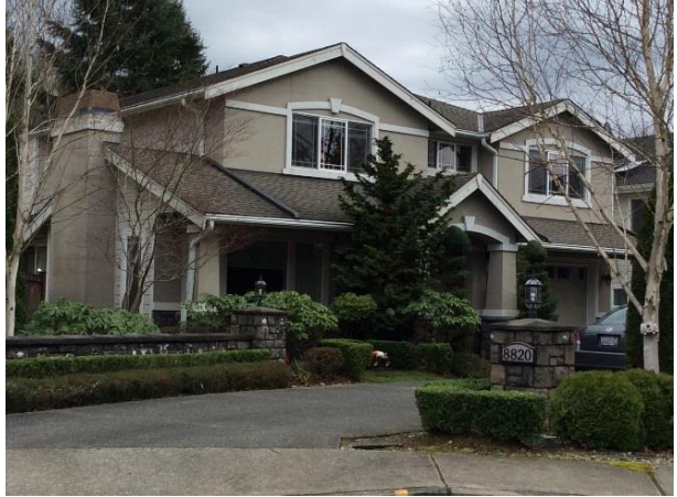
Grade 10/ Year Built 2004/ Total Living Area 4,500