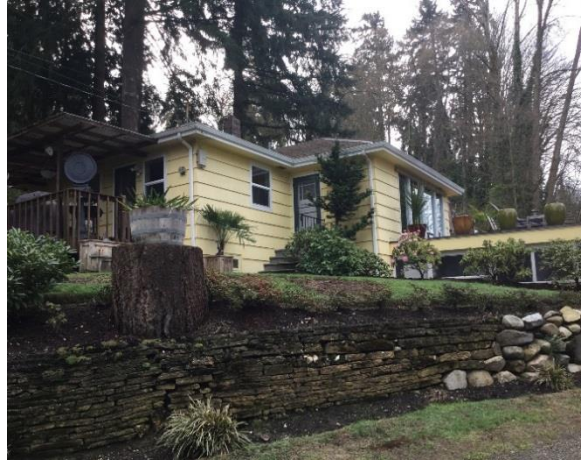
Grade 6/ Year Built 1930/ Total Living Area 970