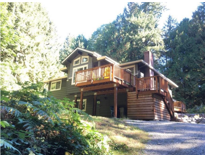
Grade 8/ 1969/ Total Living Area 2540