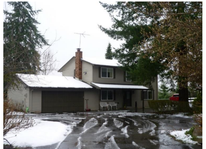
Grade 7/ 1978/ Total Living Area 1950