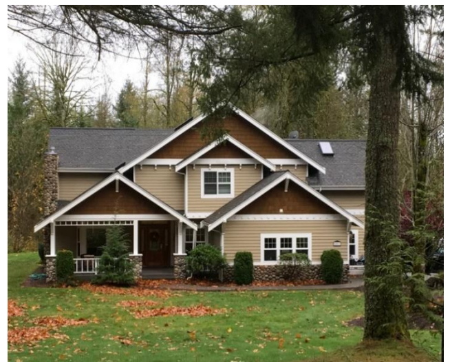
Grade 9/ 2000/ Total Living Area 3270