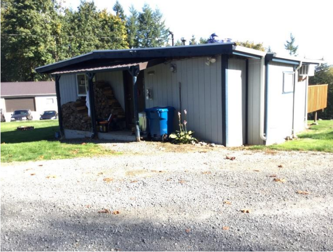
Grade 4/ 1967/ Total Living Area 670