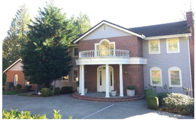
Grade 11/ 1987/ Total Living Area 5200