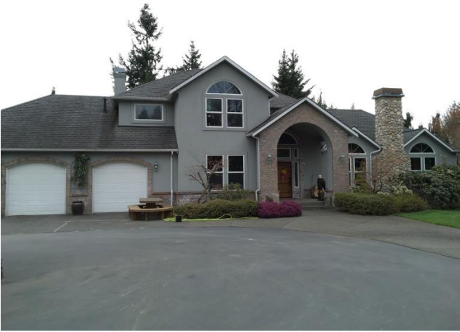
Grade 10/ 1997/ Total Living Area 3570