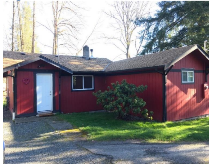
Grade 5/ 1938/ Total Living Area 1030