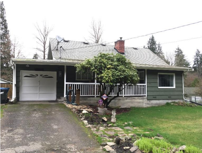
Grade 6/ 1948/ Total Living Area 1430