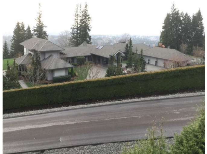
Grade 13/ 1993/ Total Living Area 8210