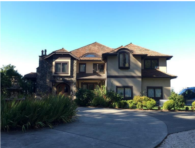
Grade 12/ 2002/ Total Living Area 6480